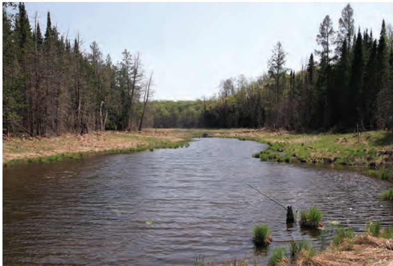
The spring feeds a trout stream that includes high-quality brook trout habitat and cold water necessary for their survival.

“NWLT is honored to partner with the Bassett family to protect this unique property forever. The Moraine Springs property is a wonderfully diverse mix of rolling hardwood forest, wetlands, springs, trout streams and lakeshore. The Bassett family’s donation of a conservation easement is an incredible way to honor the spirit and legacy of their mother,” shared Kari Kirschbaum, NWLT Land Protection Coordinator. 🌲