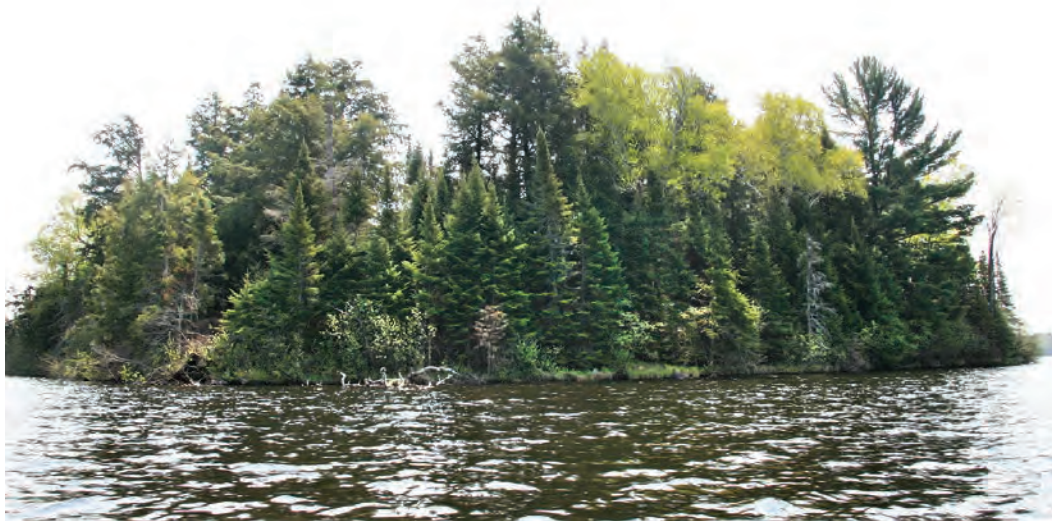
Now all of Wildcat Lake's islands are protected thanks to the Phillips' donation of a conservation easement to the Northwoods Land Trust.

Hemlock Island is approximately 4.5 acres in size with 2,252 feet of natural shoreline, and is located in the Border Lakes region of Vilas County, an area that boasts extensive forests, wetlands, lakes, and streams along Wisconsin's northern boundary with Michigan. The Border Lakes region contains more than 100 lakes connected by a complex network of high-quality wetlands and streams, supporting a diversity of native fish and other wildlife.