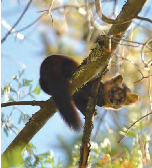
American marten near the Sack Lake Hemlocks Old-Growth Forest. Martens were once found in nearly all forested counties in Wisconsin and were integral to the trapping and fur trade industry, but today are a state-endangered species.

BCPL, the original Wisconsin land agency charged with managing Wisconsin’s trust assets for the benefit of education, owned the Sack Lake Hemlocks property continuously since January 25, 1872 when the parcels were granted by the federal government in a Federal Swamp