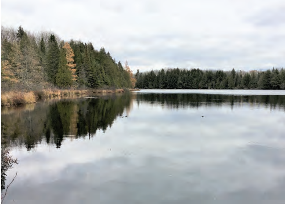
Sack Lake in Iron County.

The Northwoods Land Trust's (NWLTL) Old-Growth Forest Initiative aims to conserve some of the last pockets of old-growth forest by assisting private landowners and government agencies in protecting these remarkable habitats.