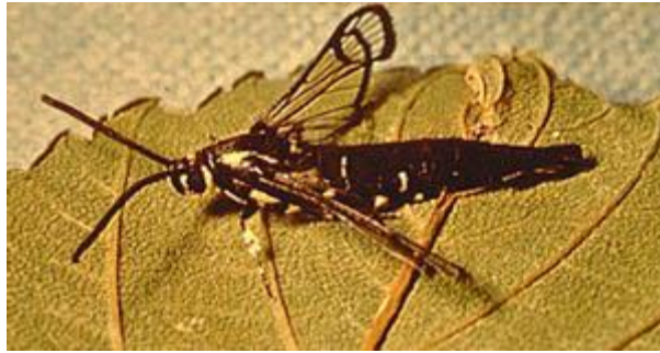
Lesser peachtree borer

See: ash/lilac borer ( http://www.ipm.uiuc.edu/fruits/insects/ash_lilac_borer/index.html ).