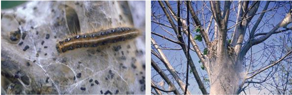
Eastern tent caterpillar (left) and damage (right)