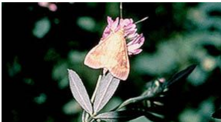
European corn borer moth

More illustrations: European corn borer , Dioryctria sp. damage