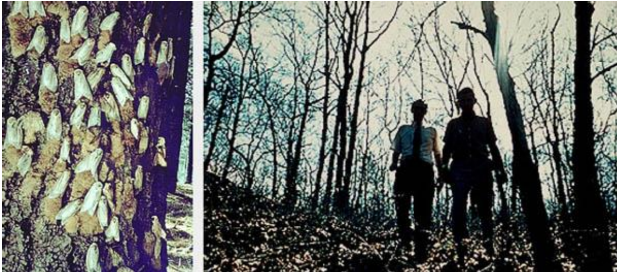
Gypsy moth females laying eggs (left); gypsy moth damage (right)

Illustrations: Gypsy moth ; use the clickable links at this page to reach the illustrations).