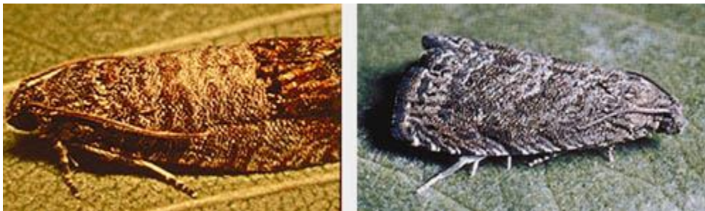
Codling moth (left), oriental fruit moth (right)

For more illustrations of the codling moth, use the West Virginia state University Index of Tree Fruit Insect Pest Photographs ( http://www.caf.wvu.edu/kearneysville/wvufarm9.html ). (Use the clickable links at this index page to reach the codling moth.)