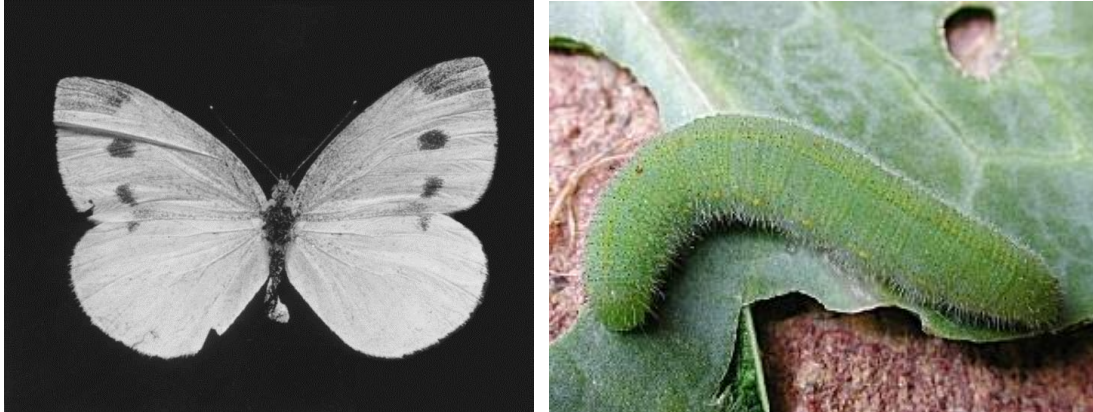
Cabbage butterfly adult (left) and larva (right)

Family Nymphalidae , the brush-footed butterflies. (The subfamily Danainae, which contains the monarch butterfly , previously was recognized as a family (Danidae) but now is considered to be part of the Nymphalidae. Similarly, the subfamily Satyrinae, which includes the satyrs, wood nymphs, and arctics, previously was recognized as a family (Satyridae) but is now considered to be part of the Nymphalidae)