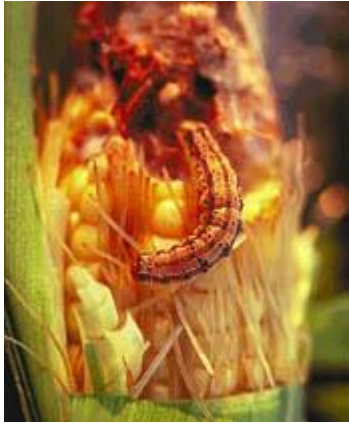
Corn earworm larva

Another common noctuid is the black cutworm .