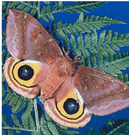
Io moth, Automeris io