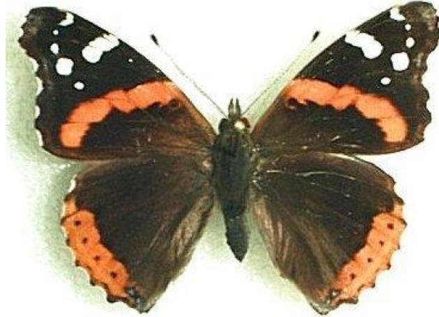
Red admiral butterfly (Clemson University)

Family Hesperiidae , the skippers (not all lepidopterists consider skippers to be butterflies)