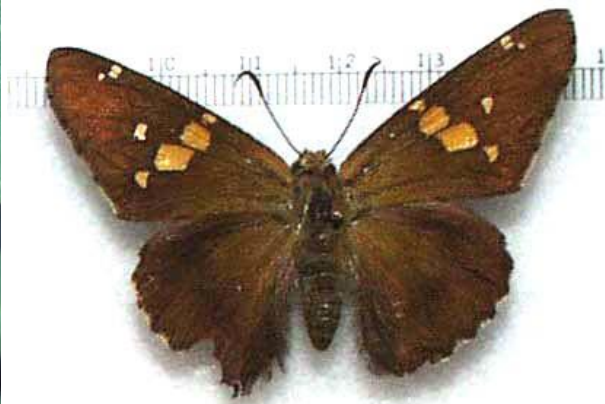
Silverspotted skipper larva (left) and adult (right)