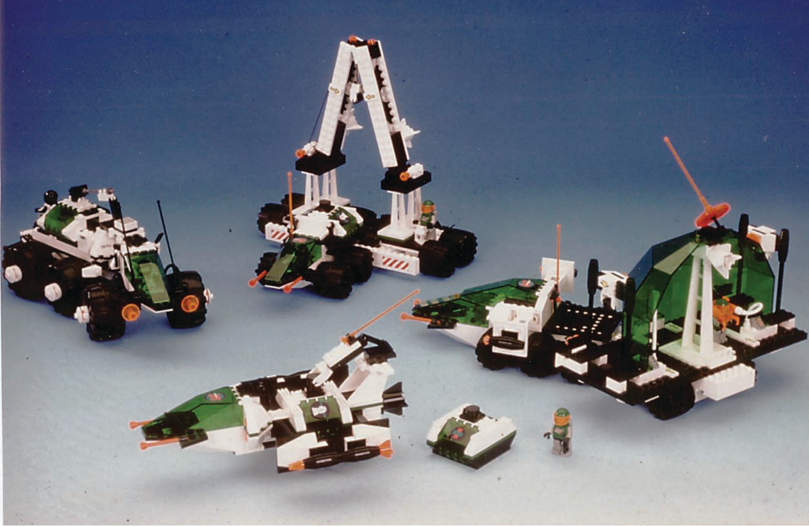
The M-Tron we almost had. A variation of LEGO's M-Tron theme dated 1987.

colors for the Futuron theme, but when we tested with kids, they were un-impressed, it was the mini-figures new diagonal print still with the space logo on it that all of them were impressed with. Kids like this kind of detail." Says Jens.