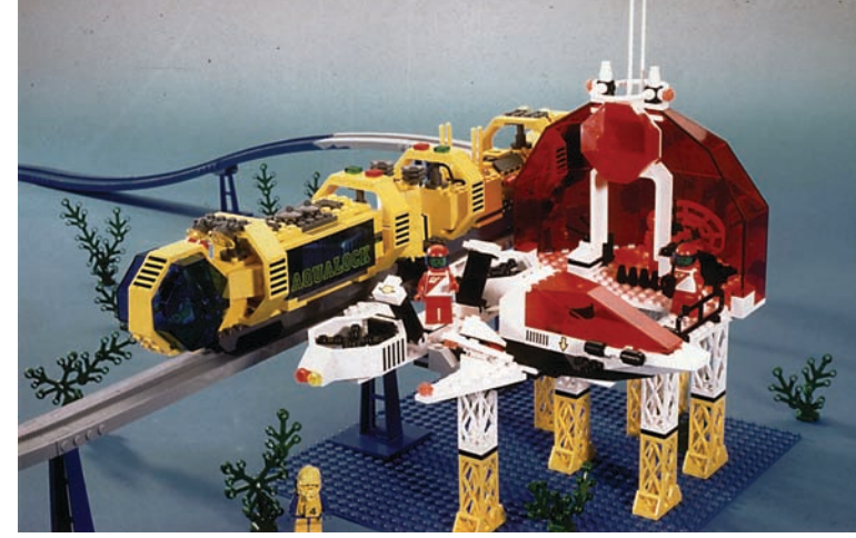
Sea-Tron monorail from around 1990.

Sea People, another Sea-Tron concept from the early 1990's.