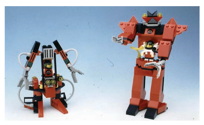
M-Tron 'powersuits' from around 1987.

only Red and White figures, we considered the red ones to be the 'bad' guys, and that they were two competing factions." Jens had wanted a brick that said 'LEGO Space' to be printed and be in all the original sets, much like the earlier 'Legoland' bricks had been in many of his town sets, but again this was a change too many.