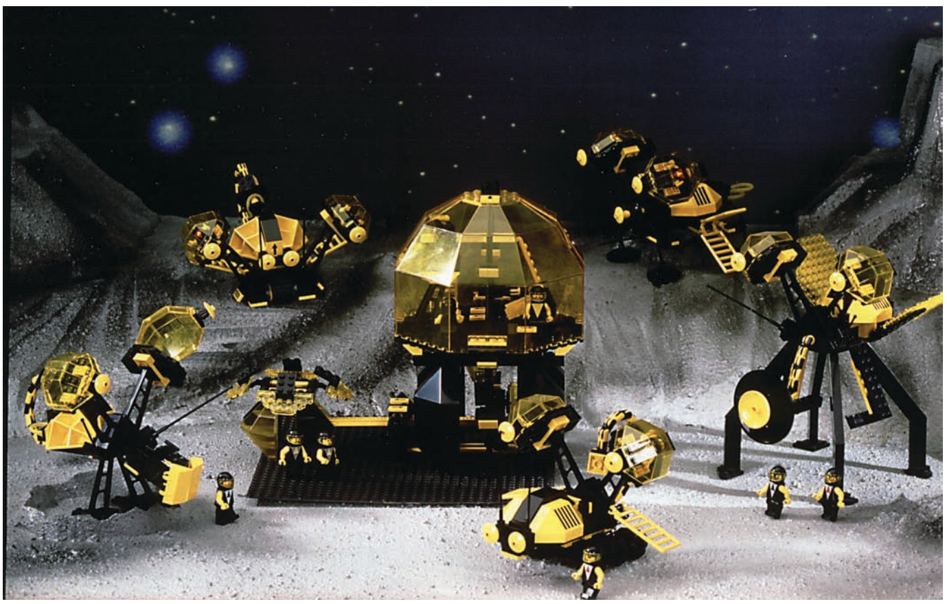
A Blacktron concept dated 1985, perhaps an early development of Blacktron 2.

plates and were just not as cool as ours." Jens chuckles.