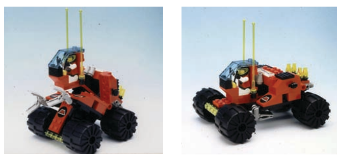
M-Tron transforming vehicle, 1987.