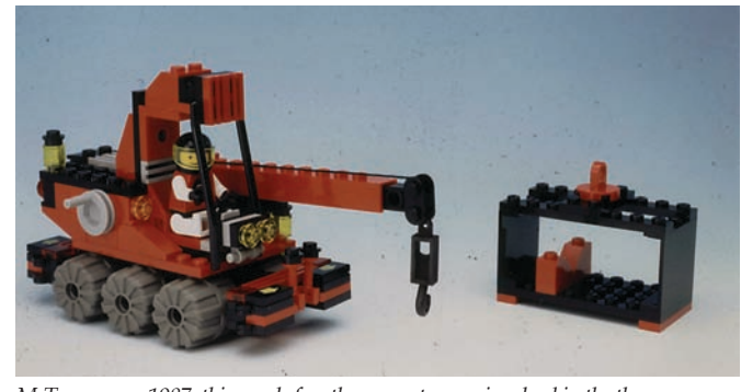
M-Tron crane, 1987, this was before the magnets were involved in the theme.