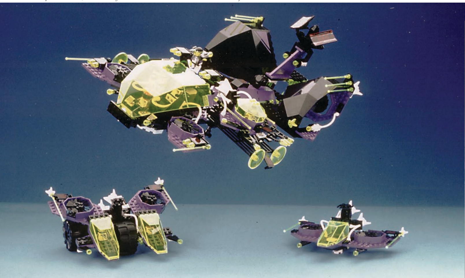
A concept dated as 1989, but with many ideas and colors that would later be used in 2001's 'Life on Mars' LEGO theme.

An unused AFOL like space concept from 1989.