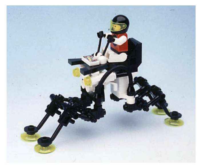
M-Tron walker, 1987, note the early greebling.