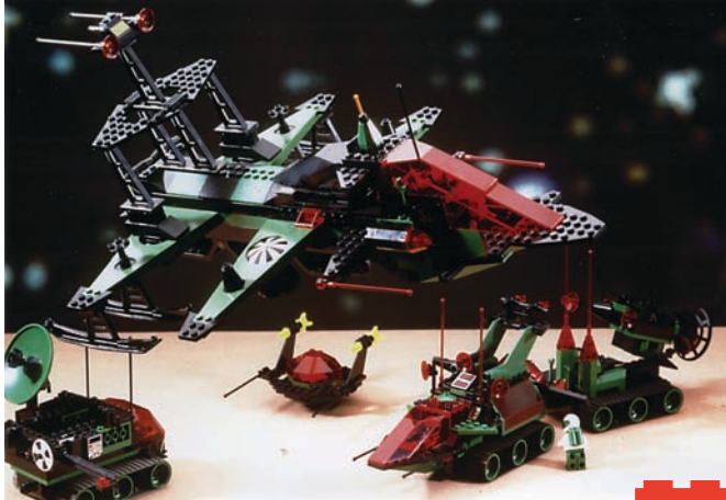
Early Space Police concept from around 1986.

"When we started LEGO Space it was difficult to make bricks in a lot of new colors, or to make new parts. The helmet had to work in space, castle and town for example." Explains Jens: "The colors of the early space sets were a result of this. If we had a lot more new colors then the wings would probably have been white, not grey, in those early ships. We started with