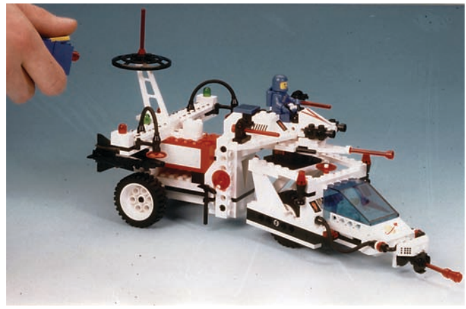
A classic space remote controlled vehicle from 1985.

Unfortunately one of the LEGO design team 'defected' to the competitor building block company of 'TENTE' and they began to work on a space line, which forced the LEGO Group's hand. Determined to be the first 'Space' construction toy onto the toyshop shelves the LEGO Group had to rush release of three of the LEGO Space sets out into the American market in 1978, more than six months before originally planned. "He left before I created the crater-plate baseplate though, so their space sets, which looked a lot like ours, were all built on several layered