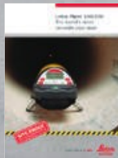
Leica Piper 100/200 The world's most versatile pipe laser