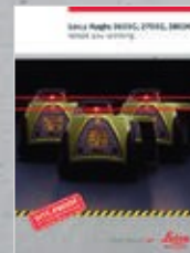
Leica Rugby 260SG, 270SG, 280DG Keeps you working