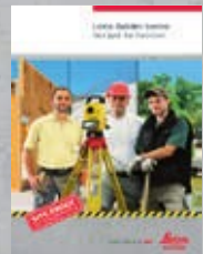
Leica Builder The theodolite built for builder