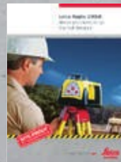
Leica Rugby 100LR Accurate and reliable self-leveling laser