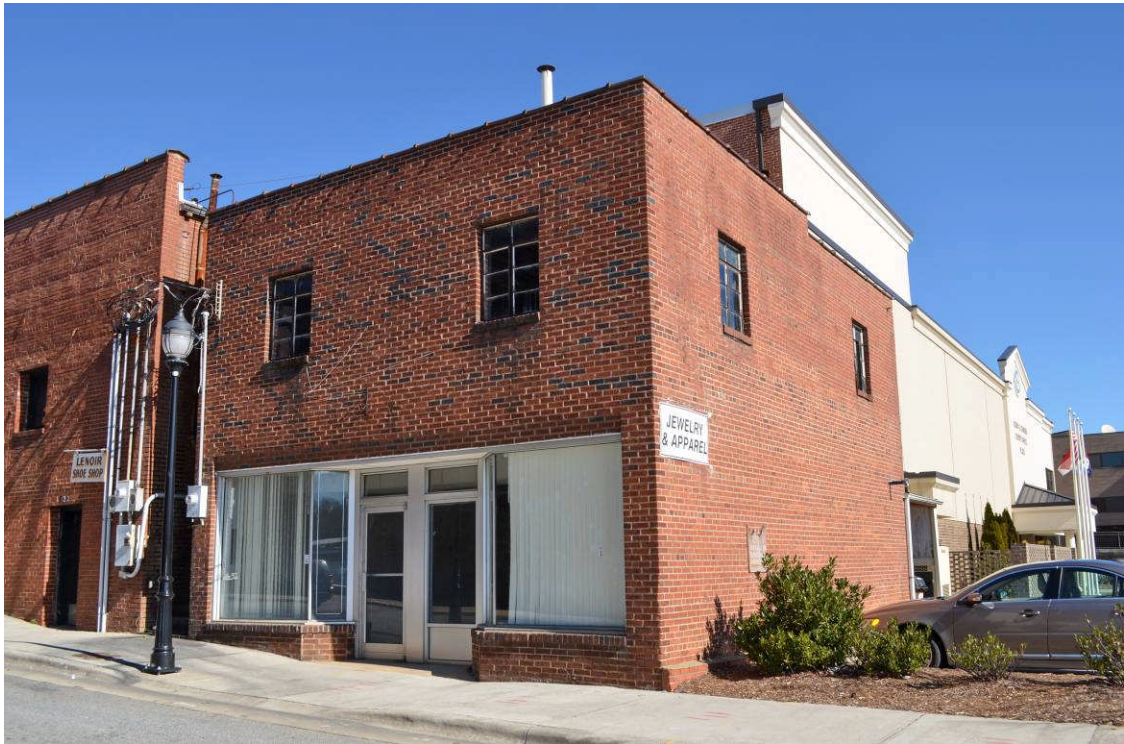
Commercial Building, 122 Boundary Street