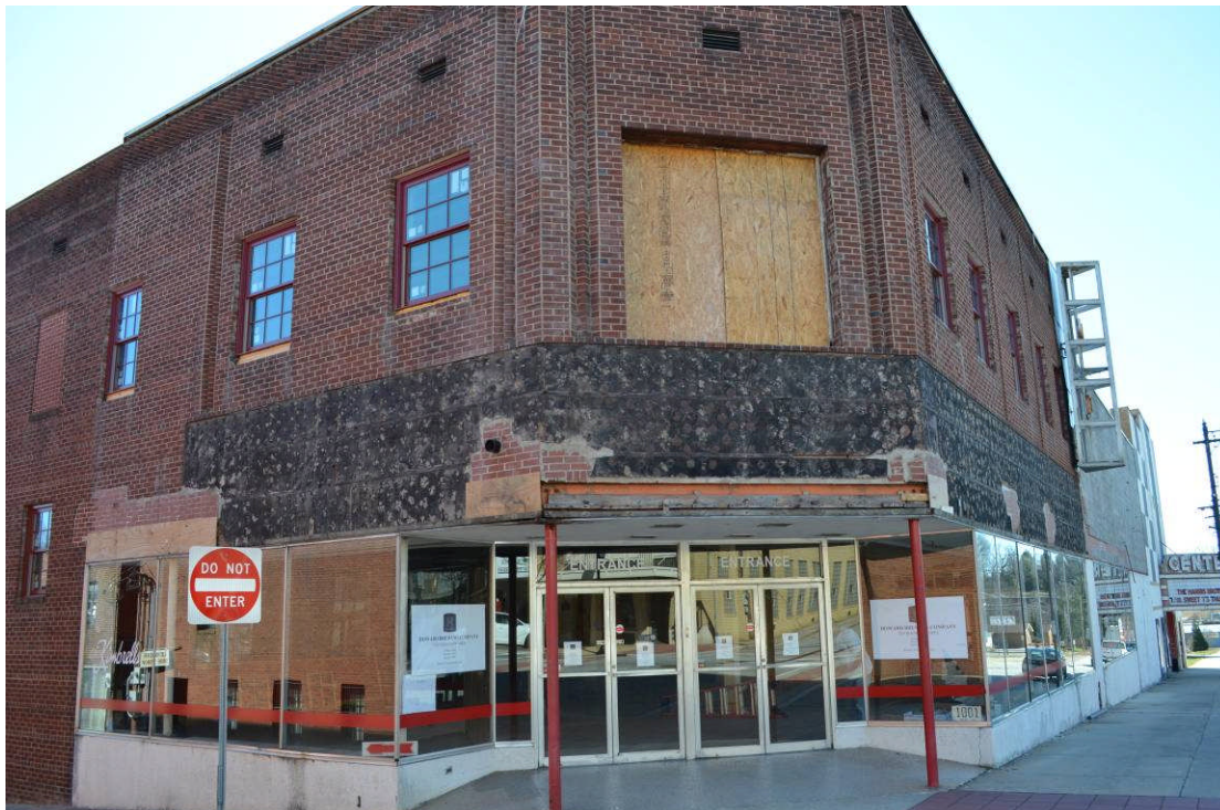
O. P. Lutz Furniture Company and Lutz Hosiery Mill, 1001 West Avenue