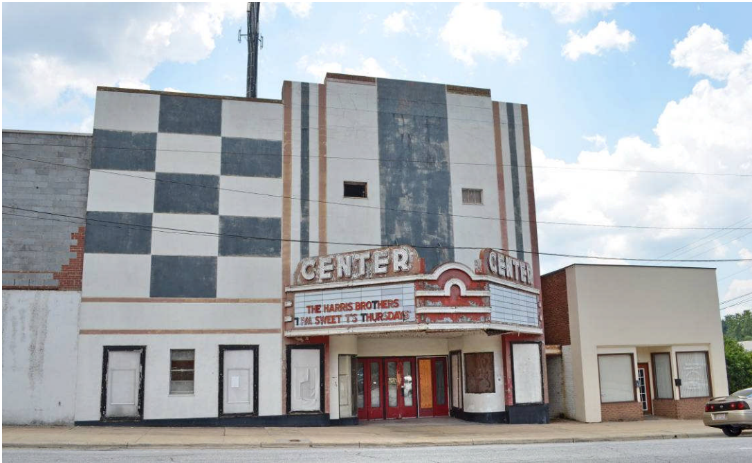
Center Theater, 1011 West Avenue