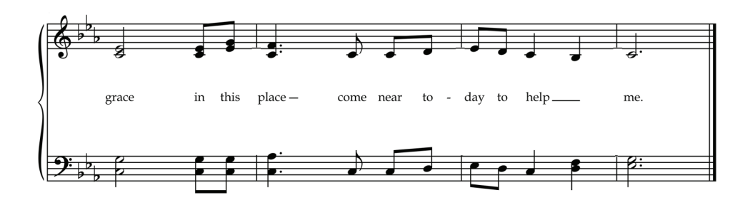
Text © 2013 The Center for Christian Ethics Baylor University, Waco, TX