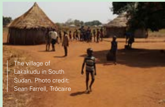
The village of Lakakudu in South Sudan.

roads near the big towns and cities are made from tarmac and are busy with cars, trucks, buses and bikes. However, in the countryside, there is no tarmac on most of the roads. Draw a picture of the road nearest to you and what it looks like to you. Ask a grown up to describe a road that is different to the one you live on (motorway/city road/country laneway) and then draw a picture of it.