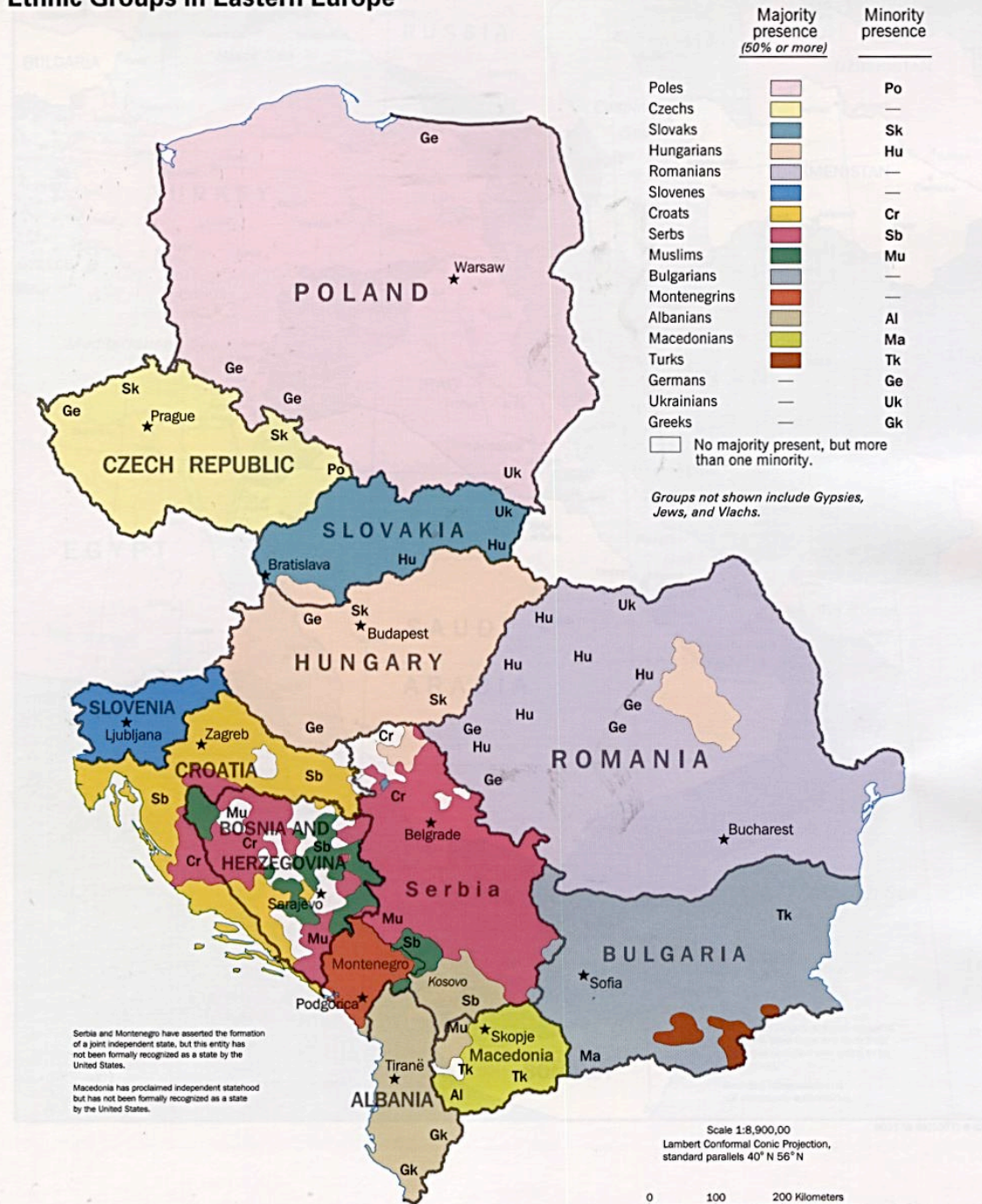
Ethnic Groups in Eastern Europe