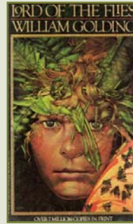
Lord of the Flies ©1954 ISBN 0-399-52920-9

Approximate Time: 3 Weeks (daily 55-minute sessions)