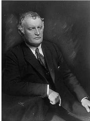
i. Portrait of Munch