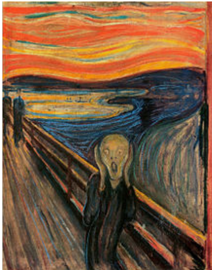
ii. The Scream , 1898