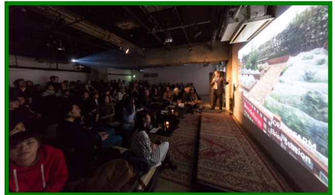
Pechakucha Tokyo urban farming presentation > More