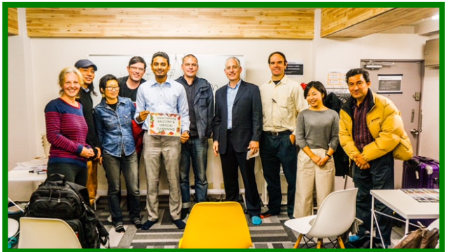
Hackerfarm urban farming workshop > More