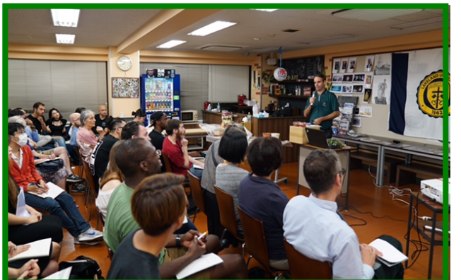
Lakeland Japan University urban farming lecture > More