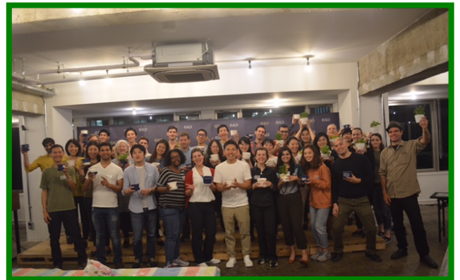
Social Innovation Japan urban farming workshop > More