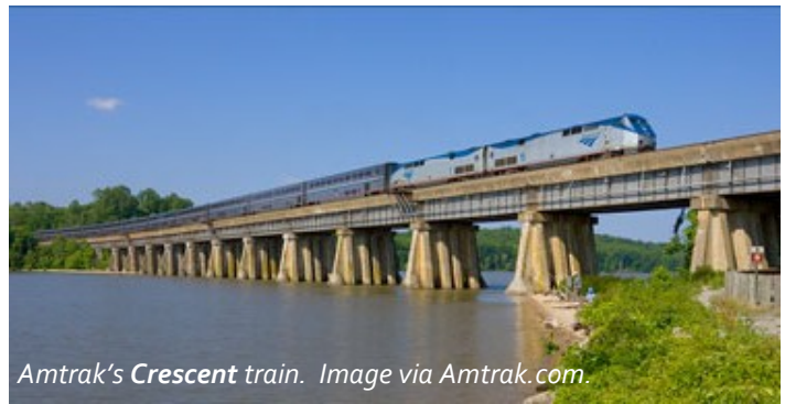
Amtrak's Crescent train.

Midwest states were commended for increasing speeds along its corridors, rebuilding its rail stations, and bringing on new equipment. "The Midwest rail passenger infrastructure is be-