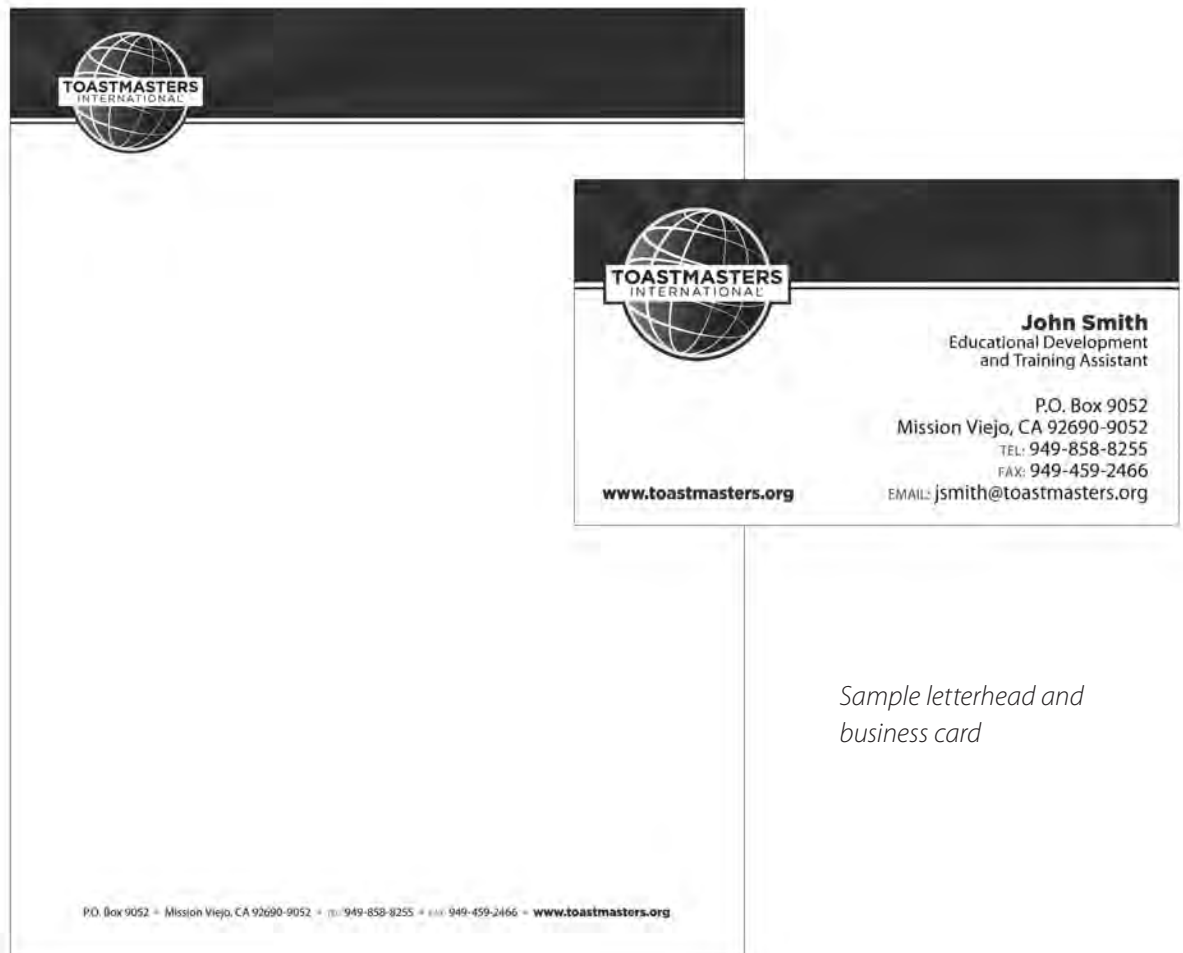
Sample letterhead and business card

Your support in following these branding and copyright guidelines is greatly appreciated.