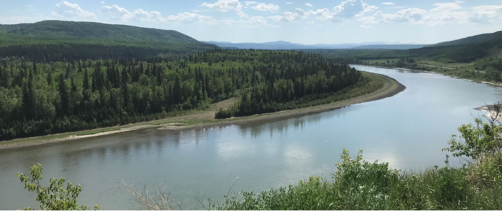
Peace River.