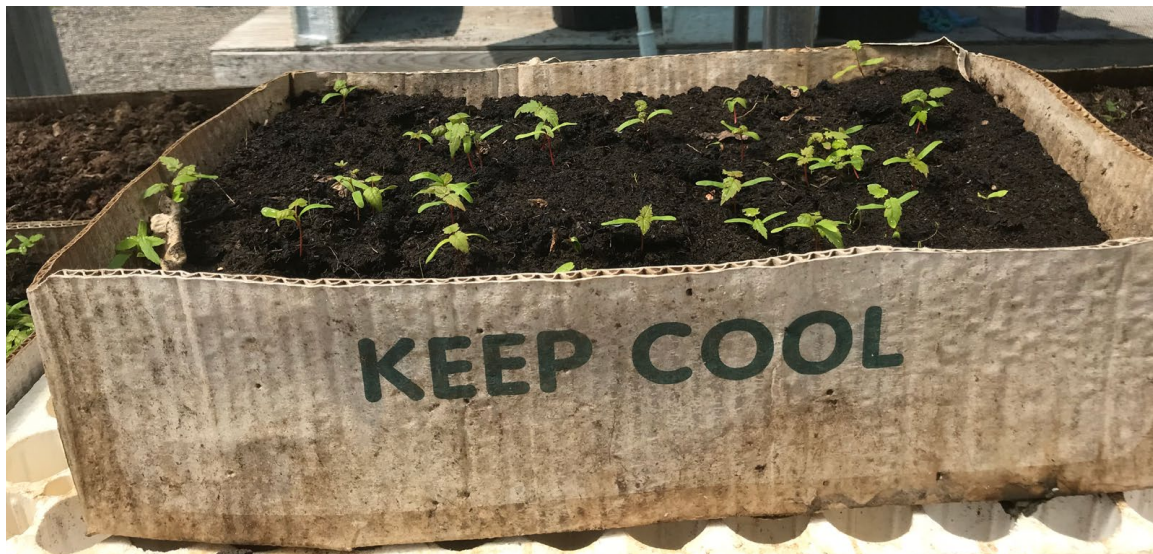
Nursery in West Moberly.

Protected areas can be a tool to help restore abundance. A participant commented that they can be used to revitalize traditional economies such as hunting and trapping. Others built on the idea of a conservation economy, which is about creating long-term resilience in microeconomic systems and is good governance. Protected areas can support the conservation economy, for example by addressing climate change through carbon sequestration and creating “a light footprint economy.”