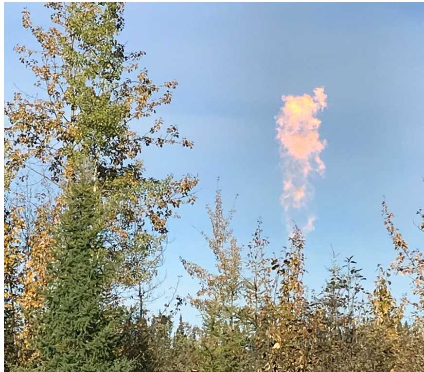
Fort Nelson First Nation.

Some participants voiced uncertainty about the Province's commitment to IPCAs. A participant from BC ECCS acknowledged that political support for protected areas varies between provincial governments, but also reminded participants that public servant dedication to their conservation responsibilities endures through changes of government. B.C. government participants said the Province has been committed to working on IPCAs for a while, and is currently working closely with Coastal First Nations. They agreed that IPCAs need to be driven by First Nations, and emphasized that BC Parks is open to feedback around First Nations' interests. Even though B.C. has met the Aichi target of 17 per cent of terrestrial areas protected, the Province knows we need to go beyond that because of B.C.'s biodiversity and high concentration of species, especially endangered species.