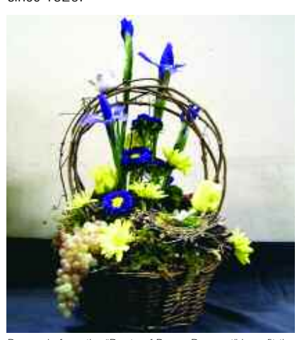
Proceeds from the "Roots of Peace Bouquet" benefit the demining efforts in Afghanistan.

Burn's Flowers has been an FTD Member since 1920.