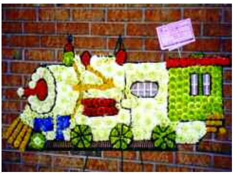
A unique train engine funeral arrangement by Heart Lake Flowers & Gifts in Brampton. ON.

Heart Lake Flowers & Gifts has been an FTD Member since 1987.