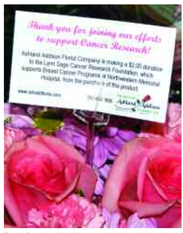
Each "Prettiest Pink" bouquet included a thank-you note from Ashland Addison for supporting the breast cancer programs at Northwestern Memorial Hospital in Chicago.