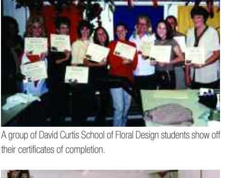
their certificates of completion.

During the business section of the course, students are also introduced to FTD services and bookkeeping methods.