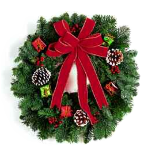
C5 - The FTD® Holiday Wreath

Take the marketing emphasis off the obvious holiday decorating and gift-giving options—poinsettias, wreaths, centerpieces, and so on—and put emphasis on the unusual. The Diamond Trading Company, the world's leading diamond sales and marketing company, successfully "reinvented" the diamond ring market by shifting their marketing emphasis from wedding and engagement rings to the trendy right-hand diamond ring.