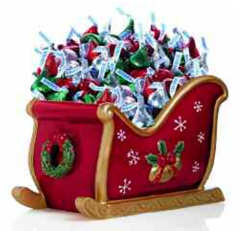
C2 – The Fitz Floyd® Bouquet Presented by FTD®

Join forces with other retailers in your area to create gift options that combine flowers with other popular products. Lou Malnati's, a popular Chicago area pizzeria, offers a "Tastes of Chicago" gift pack including their own famous deep-dish pizza along with equally popular Carson's ribs, Vienna's classic hot dogs, and Eli's cheesecake. (Try some for yourself at www.tastesofchicago.com.) A gift of this kind, representing popular products from multiple retailers, has greater appeal to many customers than a pizza (or flowers) might have on its own.