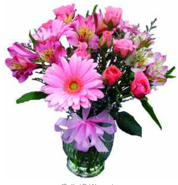
"Prettiest Pink" bouquet