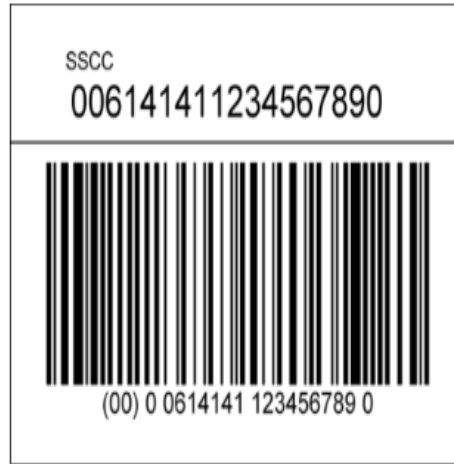
Figure 6.6.5-1. The basic label: an SSCC