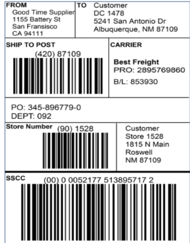
Figure 6.6.5-5. Label with supplier, customer, and carrier segments