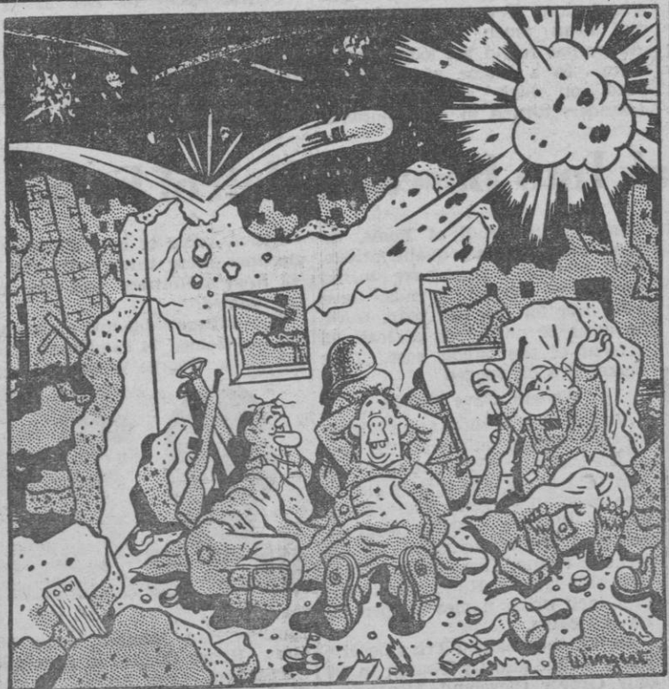
"Dames, Dames, Dames! Why don't you guys talk about the war for a change and give a man a chance to get some sleep?

of Phoenix, Ariz., have been awarded Distinguished Service Crosses