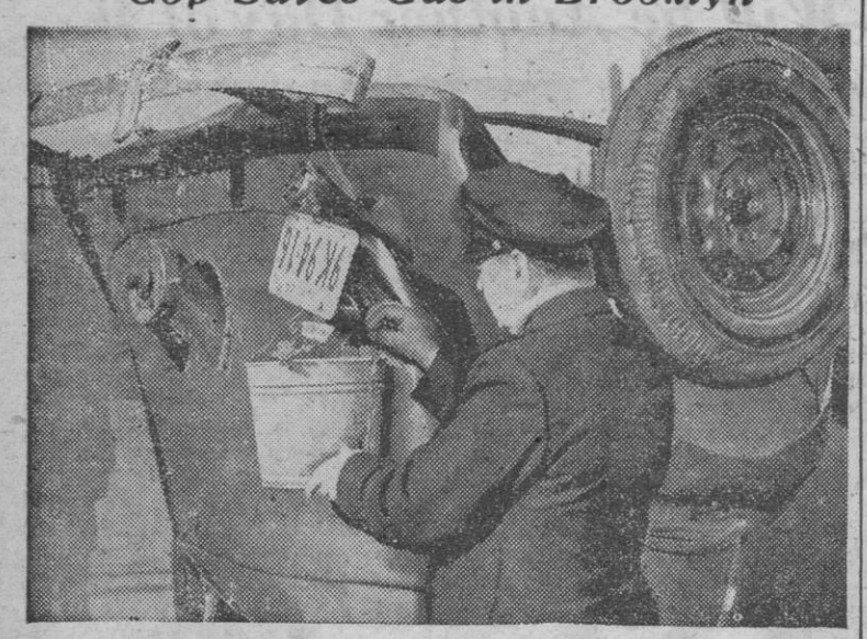
"Save every drop" is the motto of gas users back home. This is a scene in Brooklyn. First thing a cop did after seeing off the crash victims in an ambulance was to put a bucket under the tank.