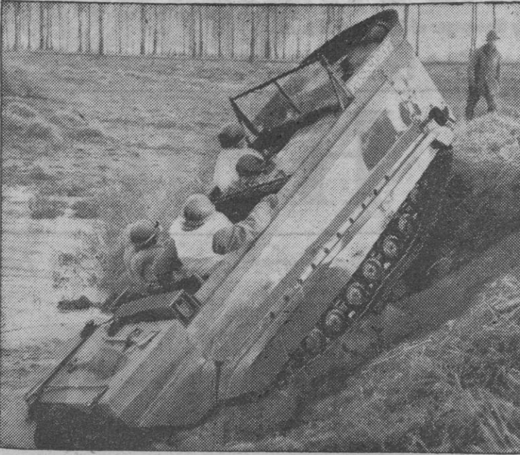
Climbing a steep bank after crossing a river s just one of the things the new "Weasel" can do. It is shown here during a test run in a training area behind the lines.