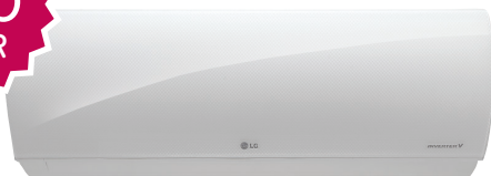
Prestige Hyper Efficiency Wall-Mounted Indoor Units