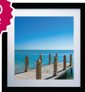
Art Cool™ Gallery Indoor Units