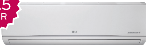
Architectural Gloss White High-Efficiency Wall-Mounted Indoor Units