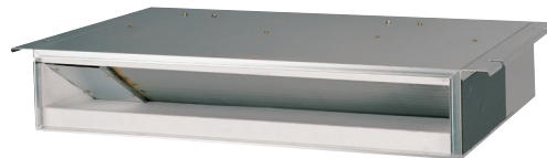
Flex Multi Ducted Indoor Units