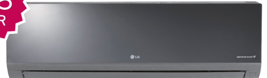
Art Cool™ Mirror High Efficiency Wall-Mounted Indoor Units