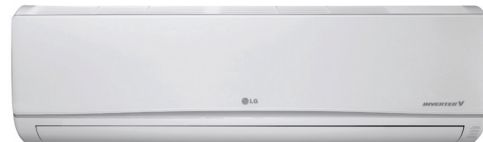
Flex Multi Architectural Gloss White Wall-Mounted Indoor Units