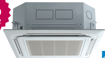
Ceiling Cassette Indoor Units