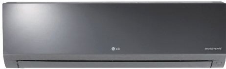
Flex Multi Art Cool™ Mirror Wall-Mounted Indoor Units

Select from a variety of elegant, quiet indoor units to complement your lifestyle. Your choice is not limited to any one type of indoor unit-mix and match four unit styles as you need.