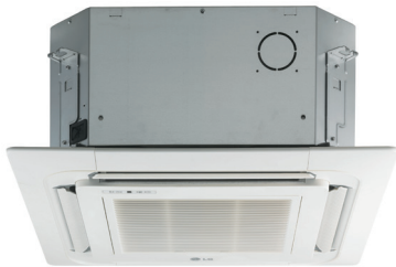
Flex Multi Ceiling Cassette Indoor Units