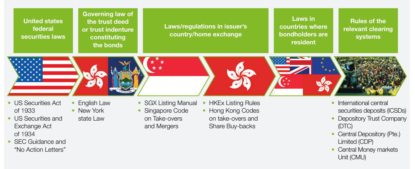
Figure 2: Laws and regulations which needed to be considered in liability management exercises.

Any liability management exercise will typically involve the laws of a number of different iurisdictions, depending on the circumstances of each transaction, as follows: