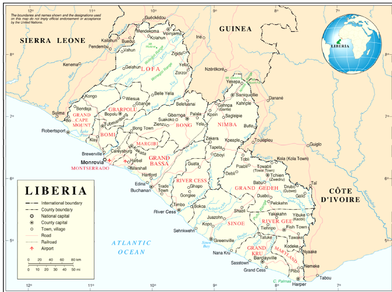
Exhibit 1 Map of Liberia