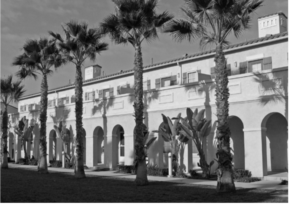
Arcades outside the condominiums at Liberty Station reflect the architectural style of the former NTC barracks.