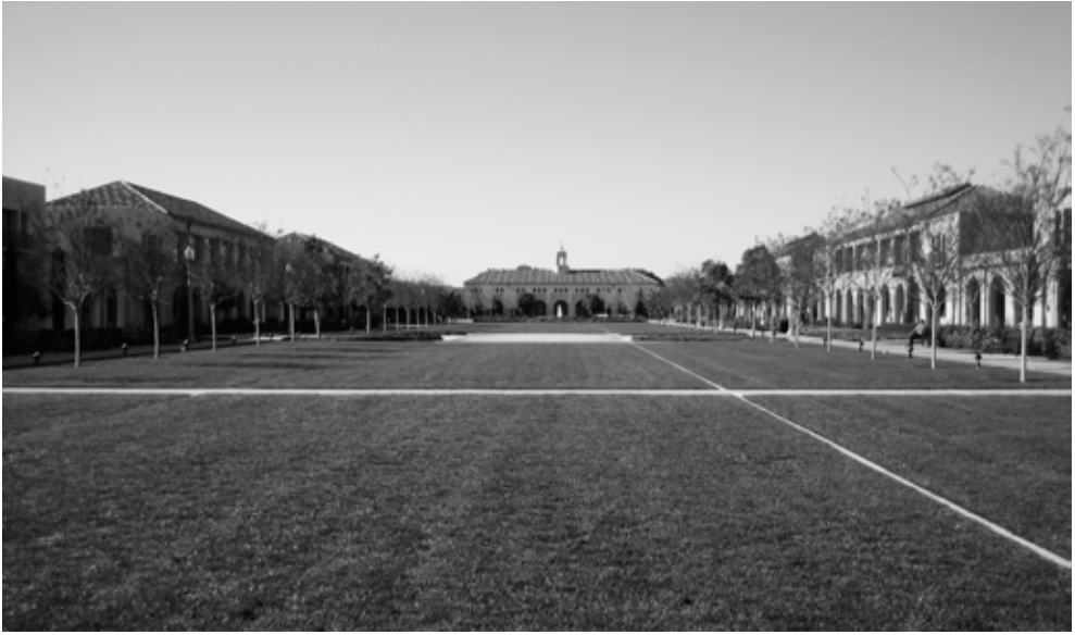
Shops and offices now occupy the buildings in the South Promenade, formerly Lawrence Court, constructed in 1922.