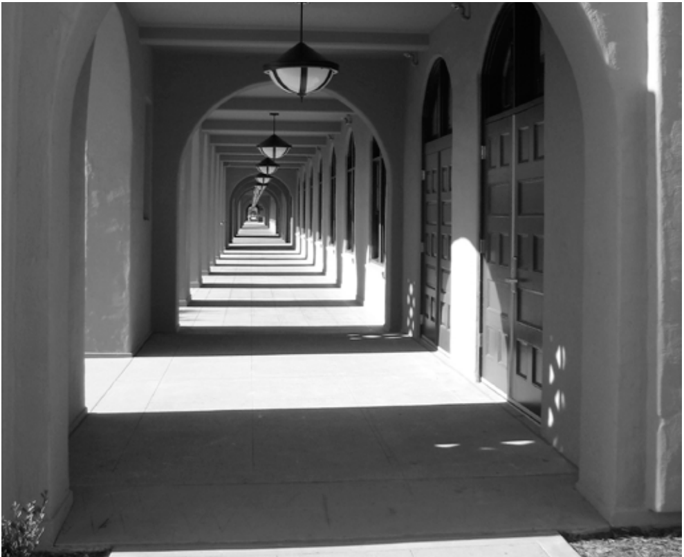
Architects preserved the pendant light fixtures in the arcades linking former barracks along the South Promenade.