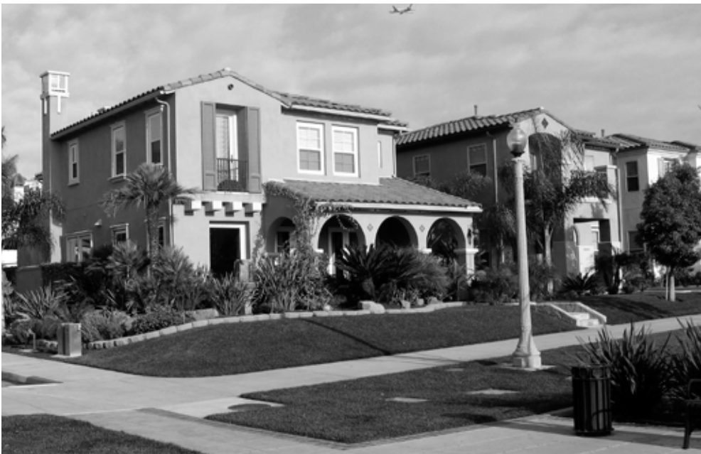
The new homes at Liberty Station conform as much as possible to the historic architectural style of the NTC with similar roofing and color palettes. They also feature off-street garages, allowing for the creation of pedestrian walkways.