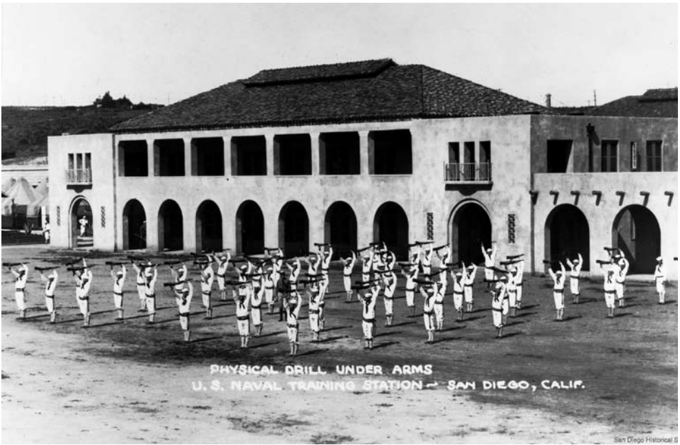
Navy recruits engage in a physical drill under arms in John Paul Jones Court, ca. 1920s. The barracks reflect the influence of the Spanish Colonial Revival style in architecture. #99:19919-2.