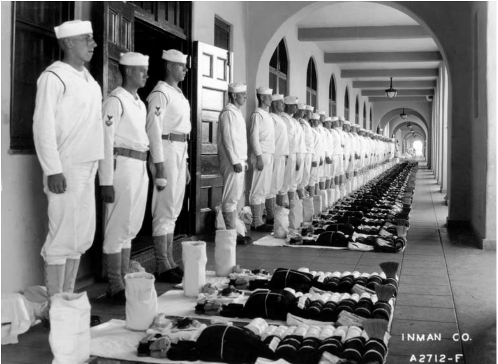
Recruits lined up for kit inspection, October 1935. ©SDHS, #89:17149-27.