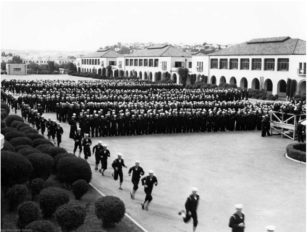
Drill in John Paul Jones Court, ND.