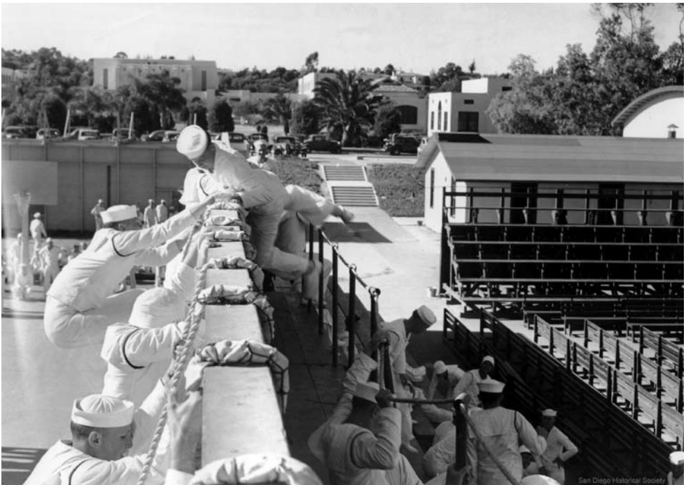
Military exercises in Preble Field, ca. 1940s. Camp Luce Auditorium can be seen in the distance.