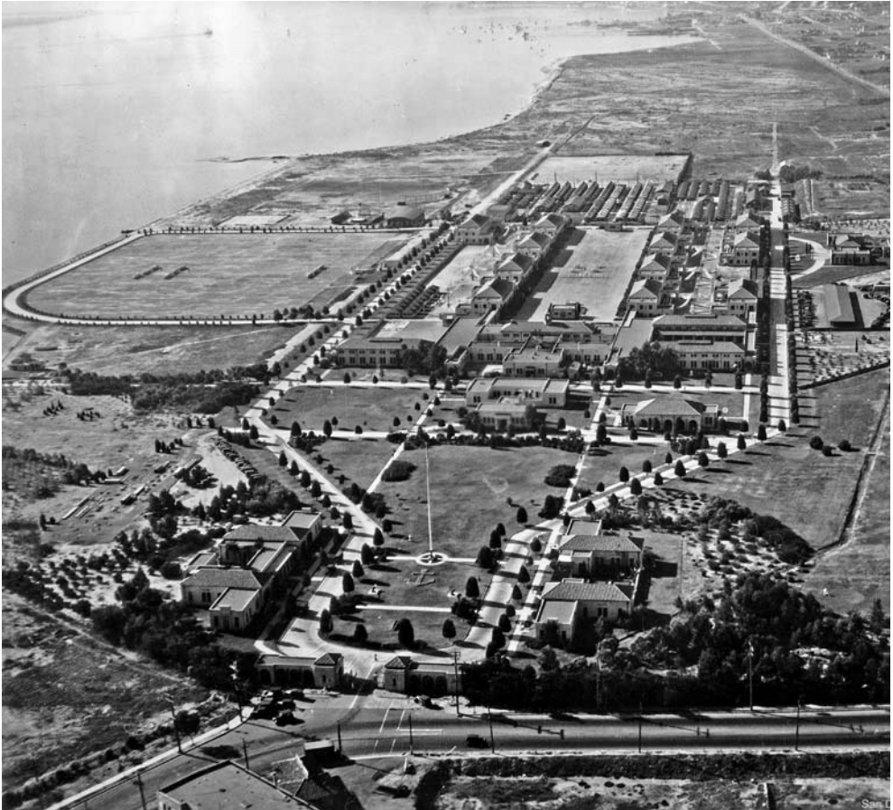
Aerial photograph of the Naval Training Station looking southwest, 1928. ©SDHS #79:559.