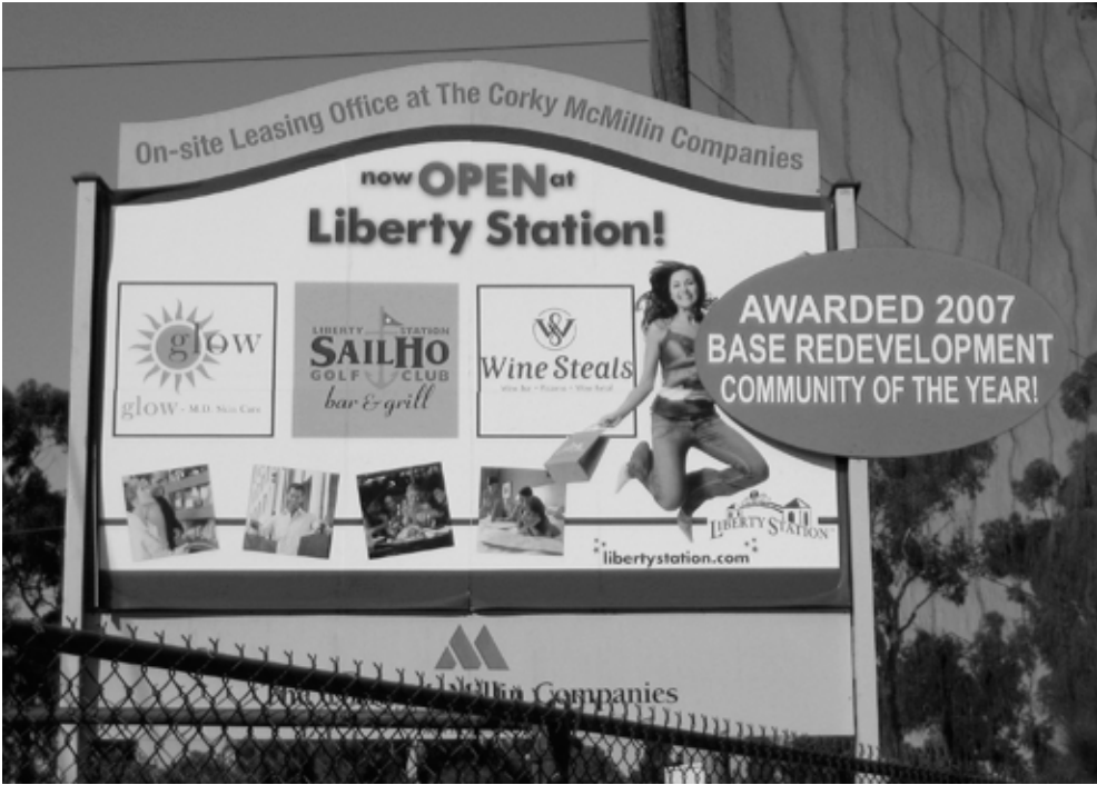
A billboard advertises the opening of new shops and restaurants around Sellers Plaza and touts Liberty Station’s “Redevelopment Award of Merit” from the California Construction Magazine.