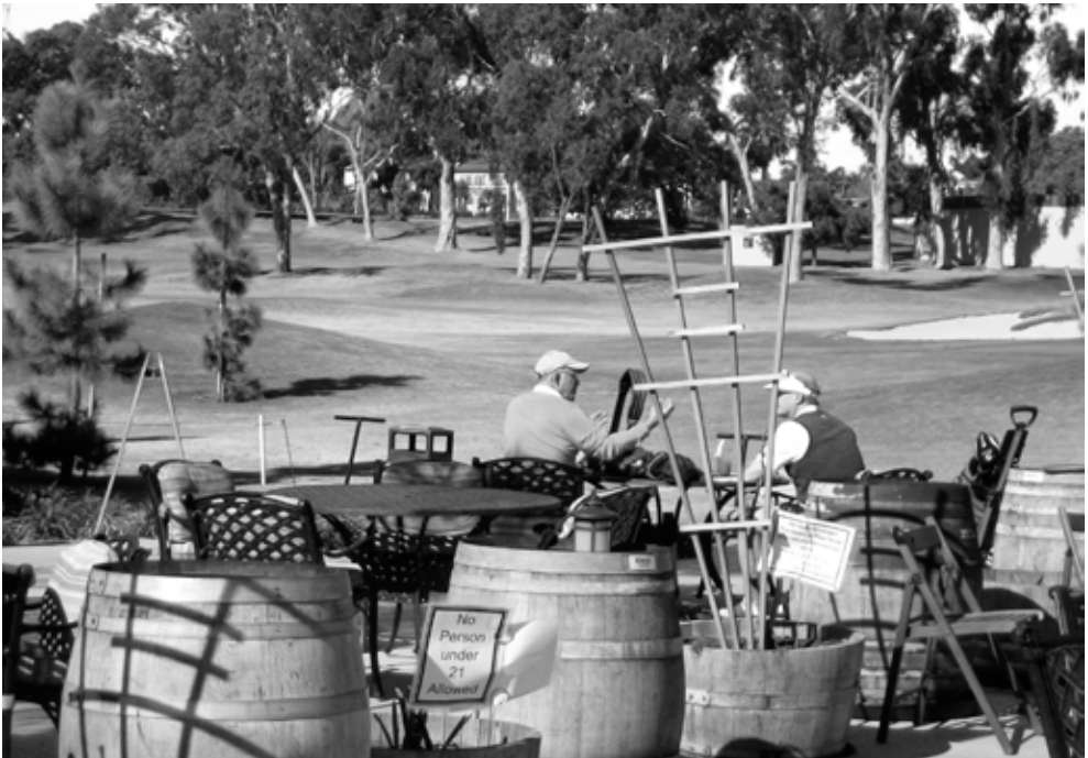
The Sail Ho Golf Course was constructed in 1925 as a four-hole golf course averaging 250 yards per hole. It has undergone several expansions but is still considered a small, short distance course.