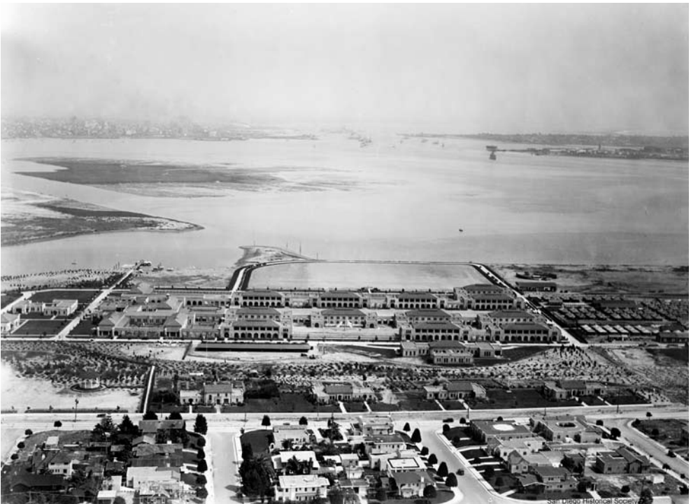
Aerial photograph of the Naval Training Station, ca. 1930.