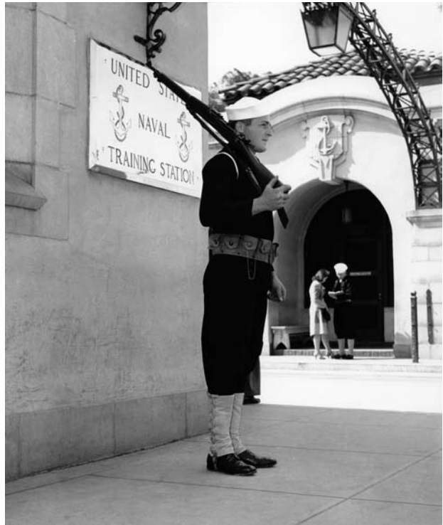
Sailor stationed at the entrance to the Naval Training Station.

Training Station in San Francisco to San Diego and persuaded local businessmen to finance the purchase of land for the Navy. San Diego’s Chamber of Commerce donated 135 acres of land located north of the Mean High Tide Line and Rosecrans