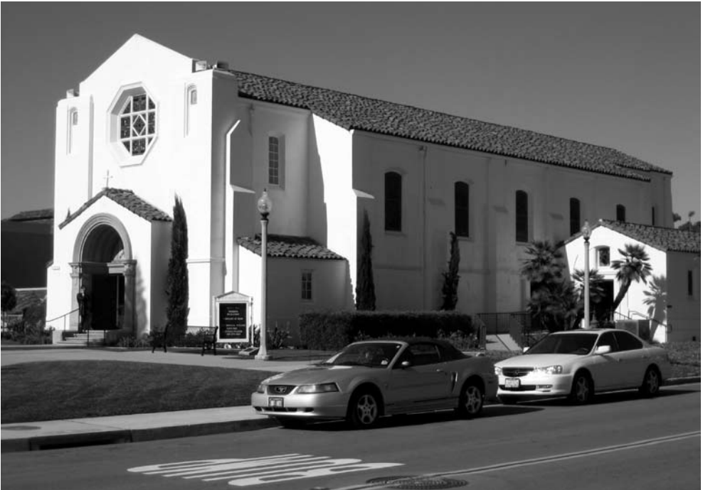
The North Chapel at the NTC was built in 1942 as a non-denominational chapel for recruits and officers as well as those aboard military ships stationed at or visiting San Diego. Restoration by developer C. W. Clark preserved stained glass windows, ornate tile, and hand-carved pews.