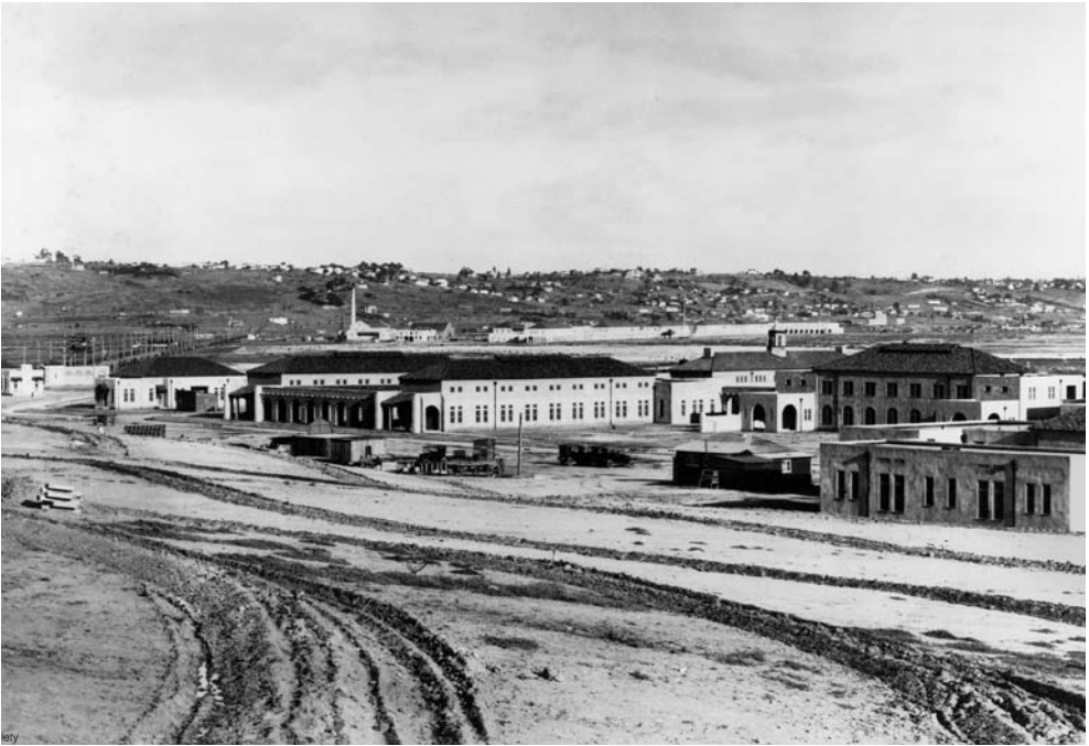
View looking northeast over the roofs of the newly constructed buildings in the Naval Training Station with the homes on San Diego's Bankers Hill in the background, ca. 1922.