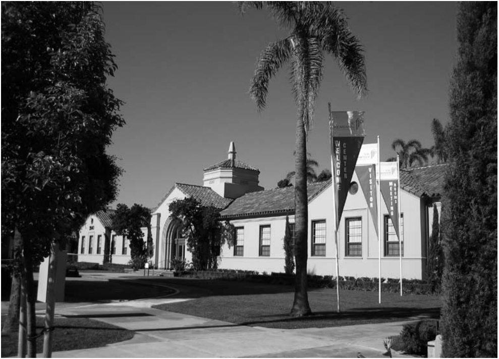
A former administration building opposite Ingram Plaza, constructed in 1942, serves as the NTC's Visitor Center. t