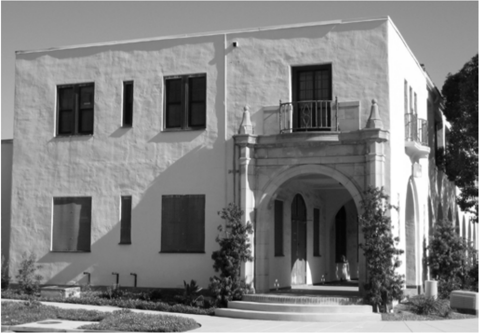
These barracks, built in 1923, will be renovated in the next phase of development: the NTC Promenade. Cast concrete units form the entrance arch to the arcade.