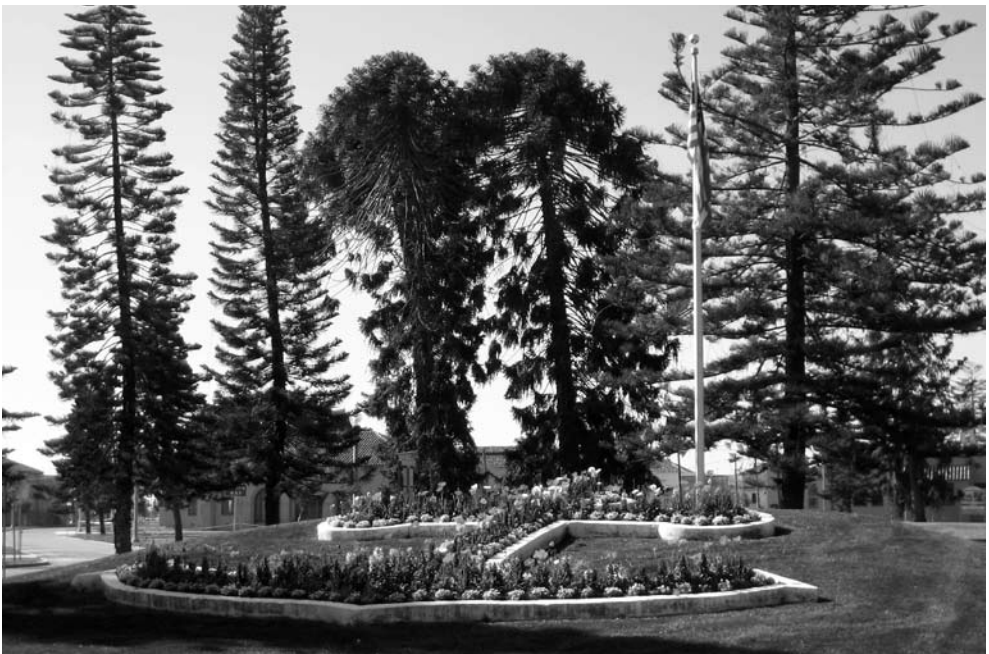
Captain David F. Sellers championed landscaping to make the base more hospitable. He was responsible for the planting of Bunya-Bunya trees, popular in the 1920s, shown here in Sellers Plaza. The flower-filled anchor was created in 1963.