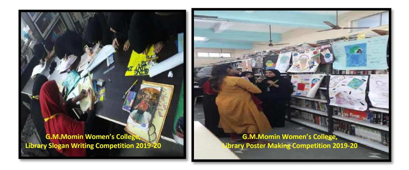
Information Literacy on Biological Science

Library Committee in association with Department of Zoology organized "Information Literacy on Biological Science" on 21<sup>st</sup> July 2018. The students were made aware of the library services, facilities, different types of collections and the smart use of library.