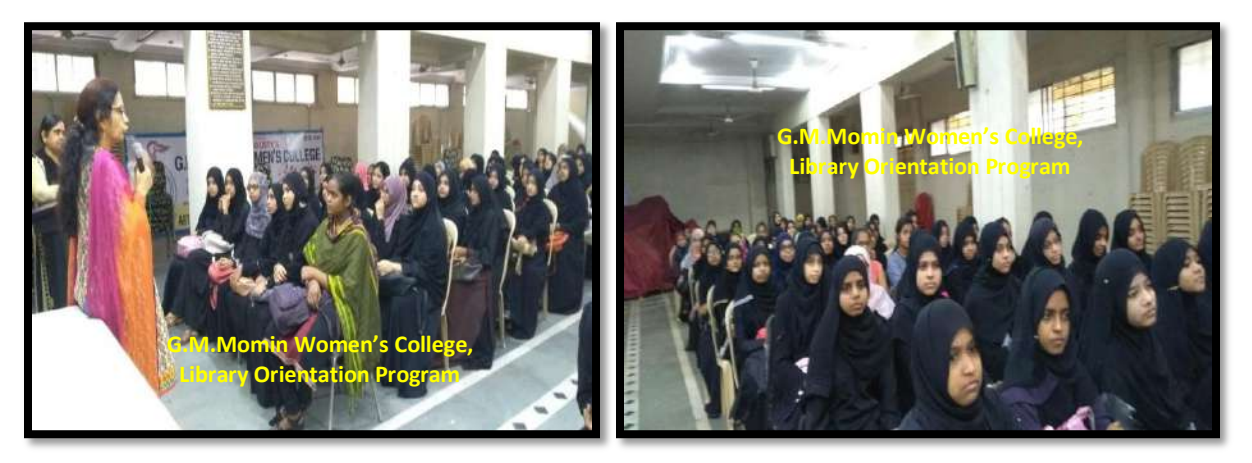
Library Book Exhibition

Orientation Program for the first year classes of all the faculties was held on Tuesday, 02<sup>nd</sup> July 2019 in the college auditorium. The main aim of the program was to promote and maximize library usage by the students. Library orientation was conducted to introduce the library's wealth of resources, facilities and services, Online Catalog (OPAC) of the Library, print resources and other electronic resources were introduced to the students.