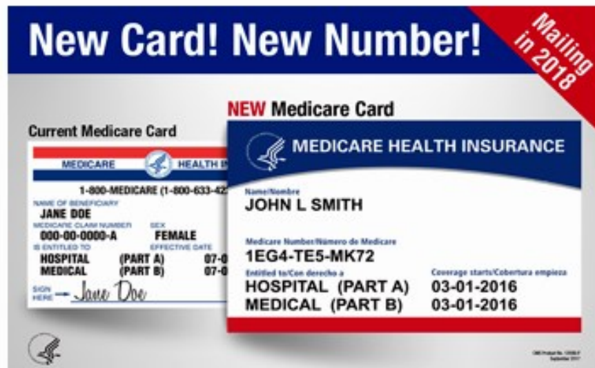
Changes in Medicare for 2019.....new card and more.