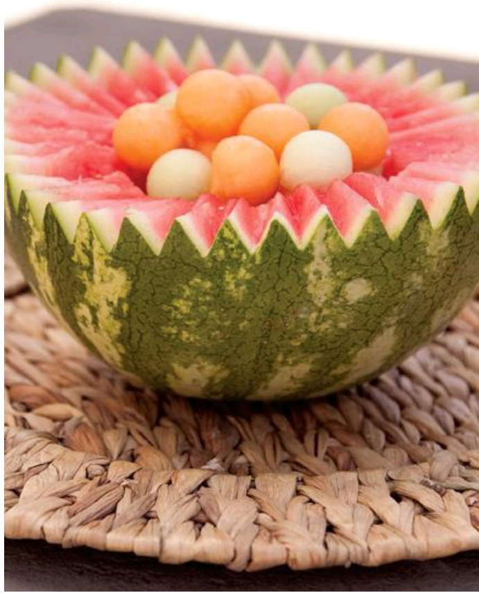
Mixed Melon Ball Salad