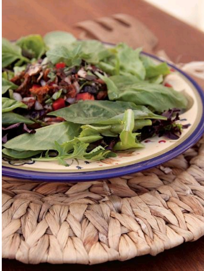
Little Italy Salad