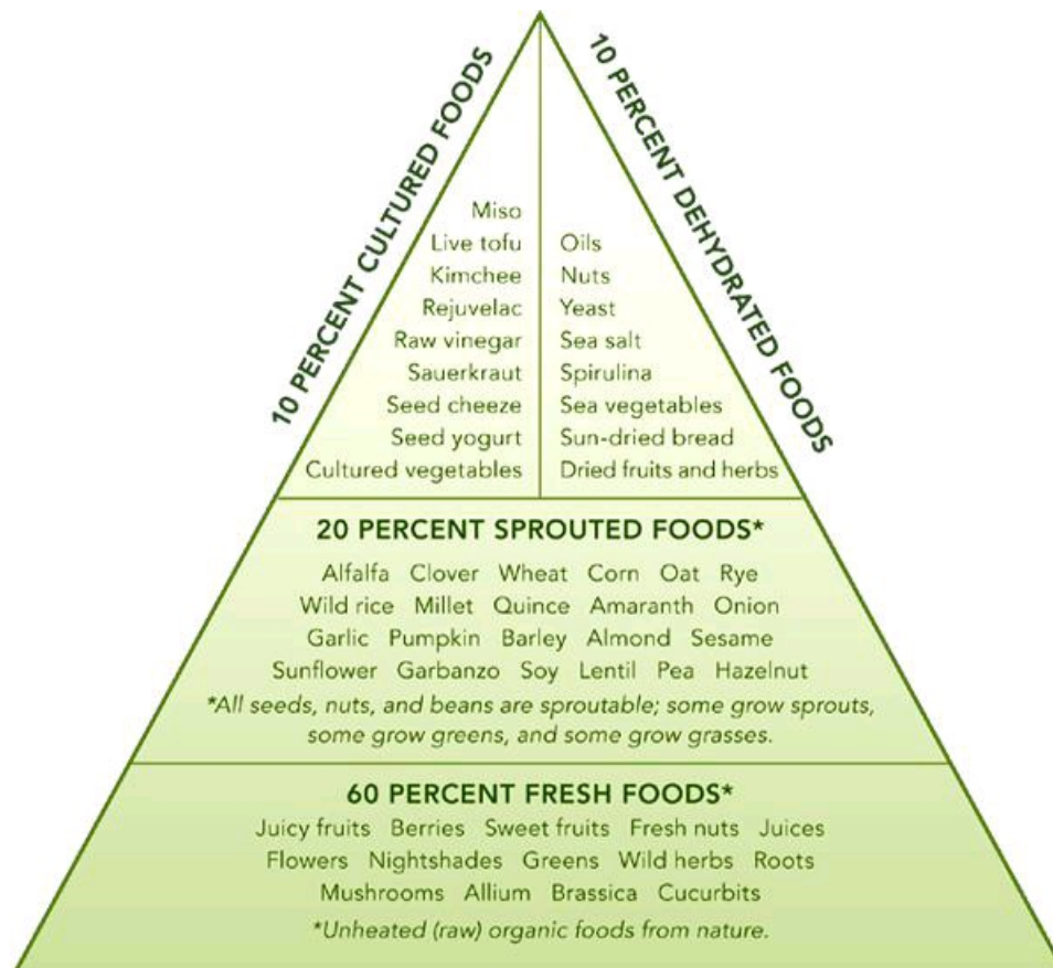
Four Living Food Groups