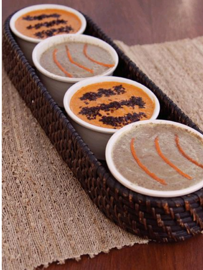
Creamy Carrot-Ginger Soup, Rosy Sea Soup