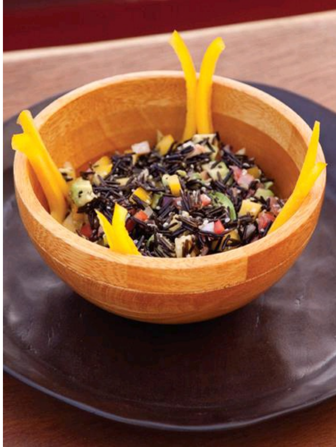
Tribal Wild Rice Salad