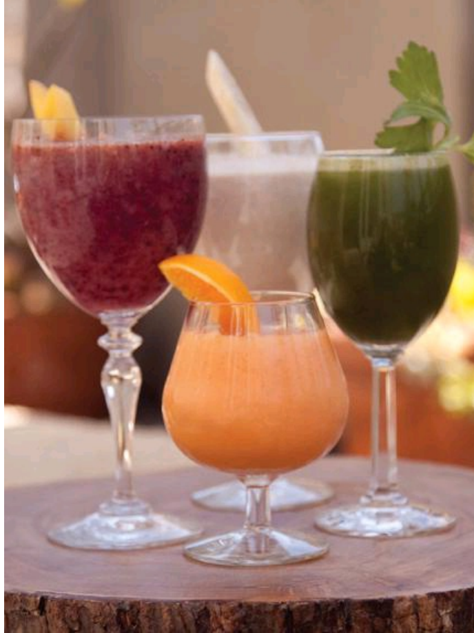
Clockwise, from top: Banalmond Milk , Green Dream , Strorage Smooth , Black Raspberry-Prickly Pear