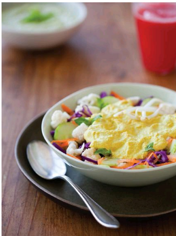
Clockwise, from top left: Tom Yum , Mellow Melon , Thai Curry

In a bowl, combine the sun-dried tomatoes, bell peppers, olives, onion, pine nuts, and basil. Place each of the crusts on an individual serving plate. Spread ¼ cup to ½ cup of the sun-dried tomato mixture over each crust. Drizzle each focaccia with the Garlic-Herb Oil and serve.