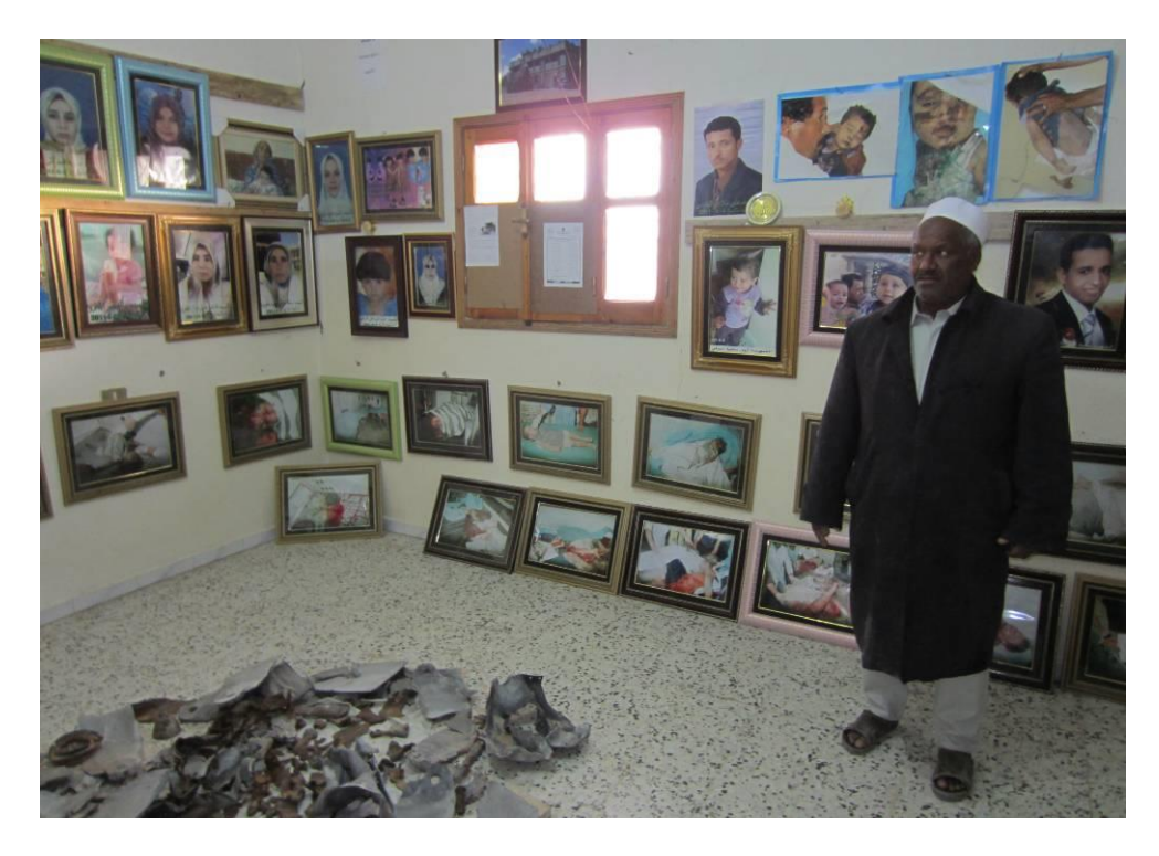
Survivor of NATO airstrikes in Majer on 8 August 2011, which killed 34 civilians

On 19 March 2011 several member states of the North Atlantic Treaty Organization (NATO), including the USA, the UK and France, launched a military campaign with air and naval strikes against Colonel Mu'ammar al-Gaddafi's forces.<sup>1</sup> The strikes were launched pursuant to UN Security Council (UNSC) resolution 1973 (2011) of 17 March 2011, which authorized member states "to take all necessary measures (...) to protect civilians and civilian populated areas under threat of attack in the Libyan Arab Jamahiriya" and introduced a "no fly zone" above Libya.<sup>2</sup> The National Transitional Council (NTC), the emerging new authority which by then controlled eastern Libya, had called for and fully supported the imposition of a no-fly-zone and international military action against al-Gaddafi's forces.