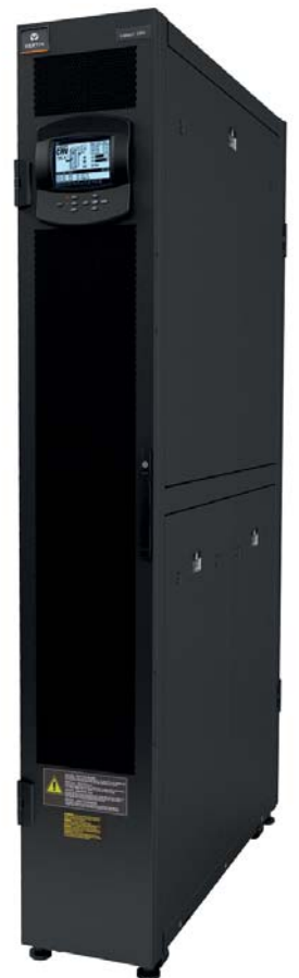
Liebert CRV 300 mm DX

The unit also allows ease of installation, through simplified cable and pipes routing from top and bottom of the unit.