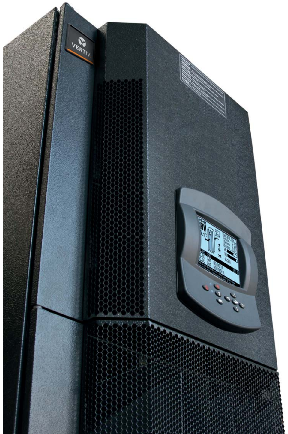
The Liebert CRV 600 mm, self-contained Thermal Management unit is ideal for the cooling of row-based applications.

The integrated compressors with cooling capacity modulation are designed to avoid peaks in absorbed power, thus reducing the stress placed on components. The Liebert CRV uses a dedicated control that also enables the compressor to operate when the external air temperature increases above standard limits.