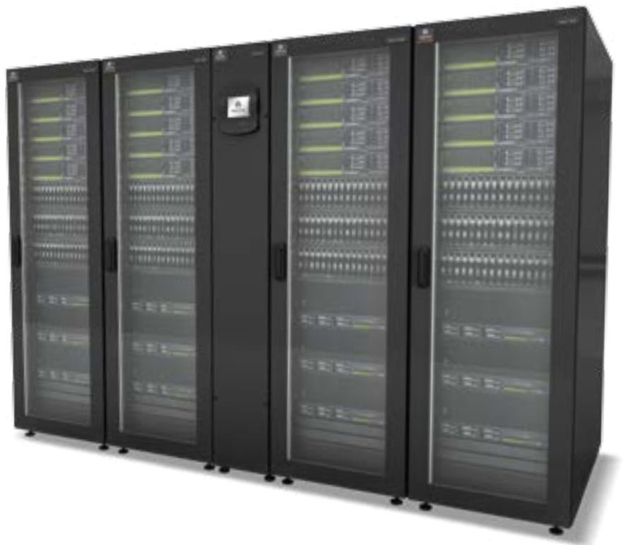
Liebert DCL with Vertiv Knürr® DCM Rack