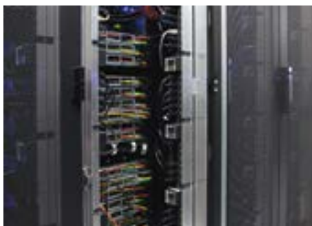
Vertiv™ Knürr® DCM Heavy-Duty Rack server rack for cooling with Liebert DCL, Liebert power distribution modules and integrated cable management