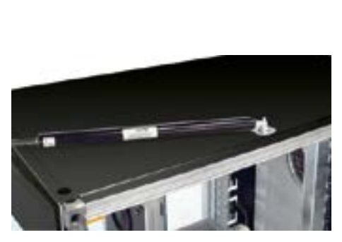
Automatic emergency door opening option for server rack