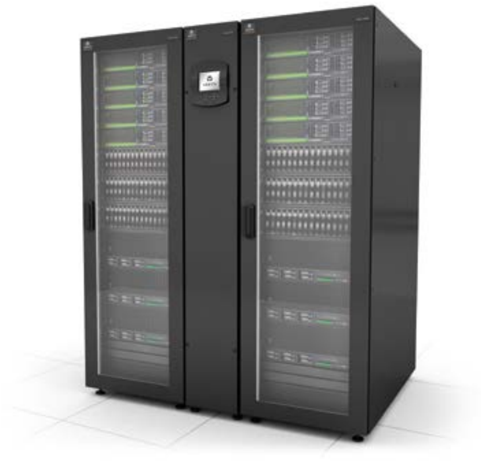
System with Liebert DCL unit for highest availability