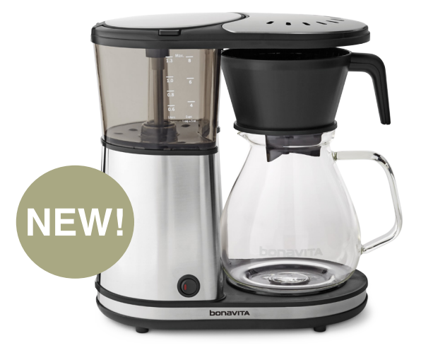
Glass Carafe Coffee Brewer