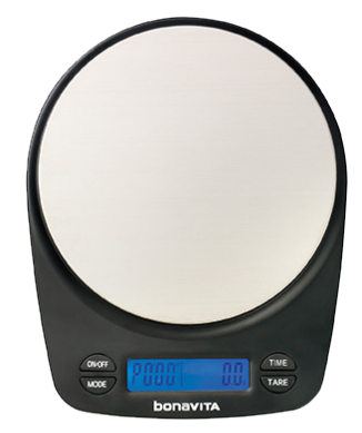
Auto Tare Scale

This little kettle brings water to a boil really fast. I bought it to take along when traveling in hotels. I like to make tea and oatmeal, and the hotel coffee makers don't actually boil water (also running water through the coffee maker still leaves it tasting like coffee.)