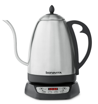
Variable Temperature Kettle