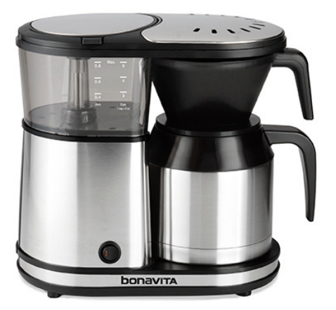
Thermal Carafe Coffee Brewer