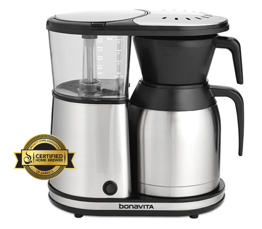
Thermal Carafe Coffee Brewer