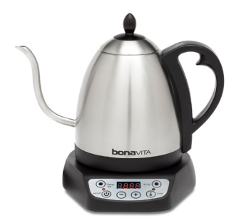
Variable Temperature Kettle