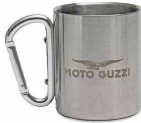
ALLUMINIO/ALUMINIUM ■ 606371M