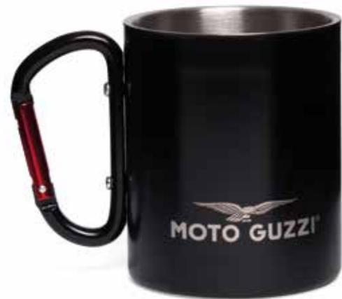
NERO/BLACK ■ 606500M

The unique Inox steel 18/8 mug with a carabiner handle grip, is an essential tool to bring with you during a trip on your Moto Guzzi.