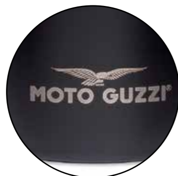
NERO/BLACK ■ 606501M

The unique Inox steel 18/8 water bottle with a carabiner handle grip, is an essential tool to bring with you during a trip on your Moto Guzzi.