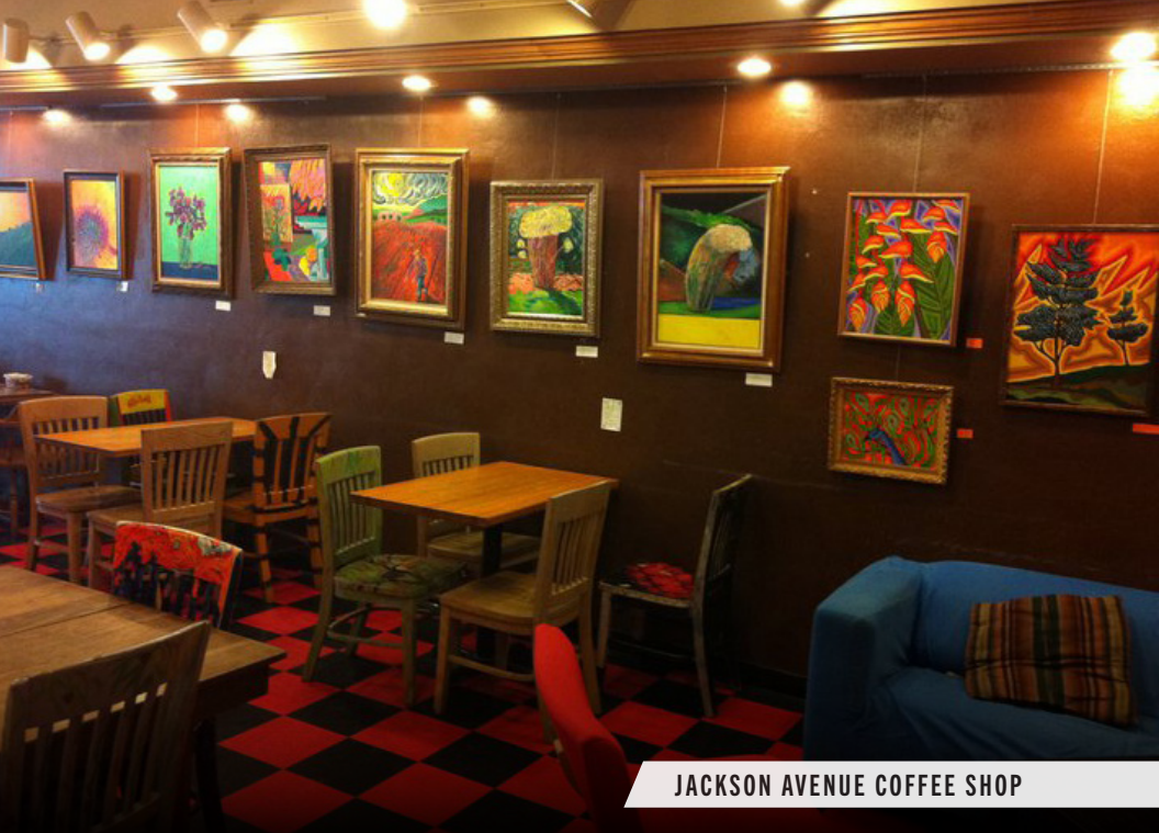
JACKSON AVENUE COFFEE SHOP