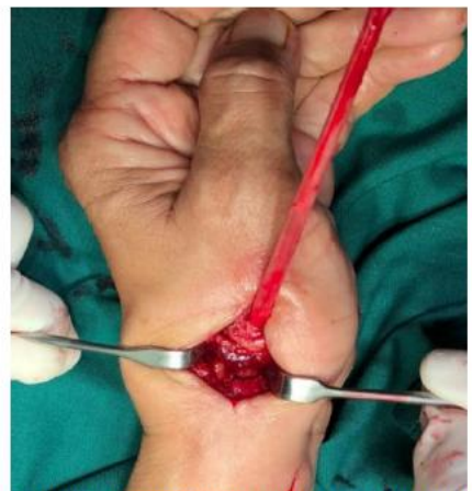
Figure 4: FCR tendon passed through metacarpal boney channel

that the FCR was split longitudinally into two halves, and passed half of it through the hole and tied it to another part and we sutured them, we harvested around 10 to12 cm of the flexor carpi radialis (FCR) tendon. This suture is purposed to protect the FCR tendon (figure 3).