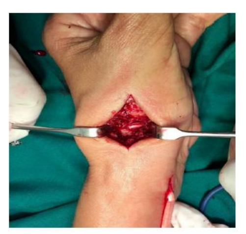
Figure 2: Removing trapezium

On this patient, we performed general anesthesia with hand on supine position and following incision at the dorsal thumb metacarpal bone with longitudinal incision. After the trapezium bone was exposed, and the superficial branch of the radial nerve was protected, we removing the trapezium, at the base of the thumb (figure 2).