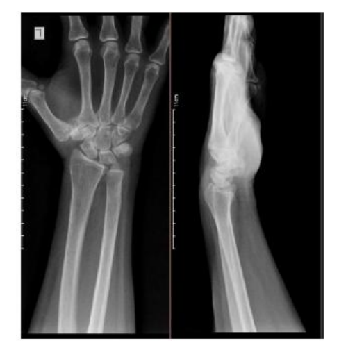
Figure 1: Anteroposterior and Lateral Radiograph shows the trapezial height space and the arthritis of carpometacarpal (CMC) left thumb.

showing the trapezial height to be 10mm and the arthritis at carpometacarpal joint of the left thumb, as shown in figure 1. The left basilar thumb arthritis Eaton stage III was diagnosed to the patient with DASH score pre operatively is 60.8.