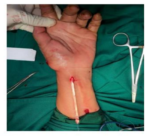
Figure 3: Harvesting flexor carpii radialis

The aim of this step was to make more space to move the thumb, so that the arthritic bone surfaces are not rubbing together causing pain. After done removed