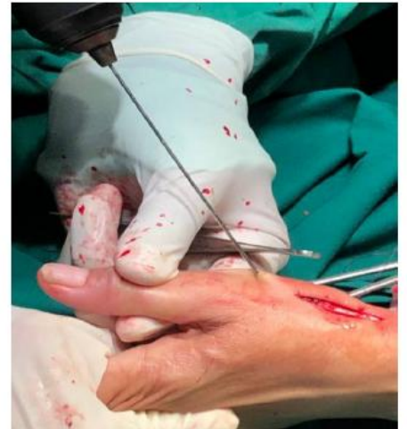
Figure 6: Using K-wire to provide temporary mechanical suspension

We sutured the tendon ball into the volar capsule and also to the ligament. After that we closed the capsule, the aim is to prevent it from escaping. We also using the Kirschner wire to provide temporary mechanical suspension, it was passed from first to second metacarpal (figure 6).