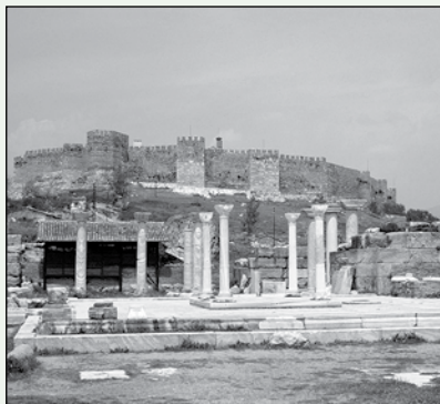
At Ephesus, the Church of St. John.

The following excerpt is from the article, “Love In John’s Writings” (Sum. 2011), which can be purchased at www.lifeway.com/biblicalillustrator .