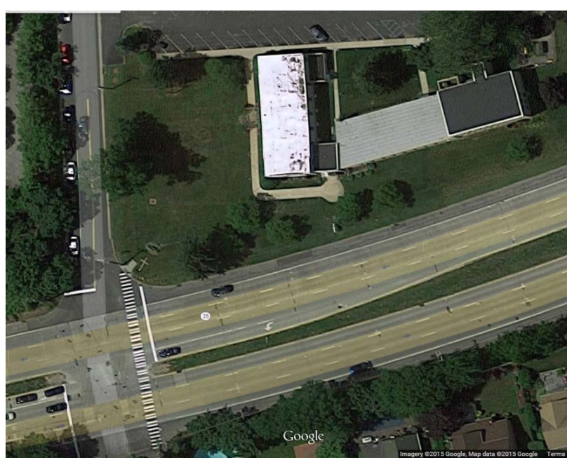
Figure 6: Example of Slowing/Accelerating Use of Shoulder with Single Solid White Edge Line, Jericho, New York

An example in New York state demonstrates that this "slowing and/or accelerating" function is not only not tolerated by police, but is subject to ticketing and fines. In 2008, in Long Island, New York, a motorist was issued a $150 traffic ticket for using the shoulder on a high-speed, suburban arterial to slow for a right turn at a signalized intersection. (Another Long Island intersection/shoulder situation, similar to the one at the ticket location is shown in Figure 6.) The motorist successfully appealed the ticket noting that many right turning drivers at that intersection use the shoulder as she did since the alternative, turning directly from the right lane, could lead to "rear-end" crashes. In other words, she was making the turn in the safest possible fashion. In this case, according to the driver's manual, the police officer was technically correct in issuing a ticket. This leads to the question of whether the officer should to be able to exercise judgment to differentiate "riding the shoulder" for a significant distance from short use for acceleration."