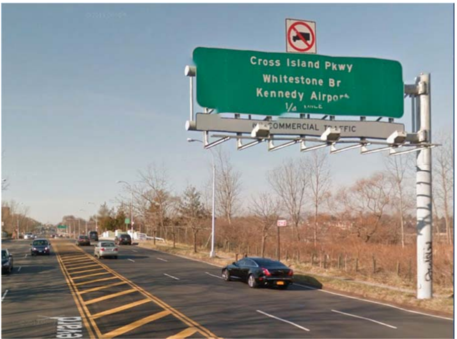
Figure 7: Example of Confusing Advance Directional Signing, New York, New York