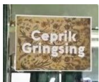
Figure 8. Monolingual sign in Latin-script Javanese (A1/55)

Other monolingual signs in Javanese were found in Schools A1 (see Figure 8) and A5 (see Figure 9).