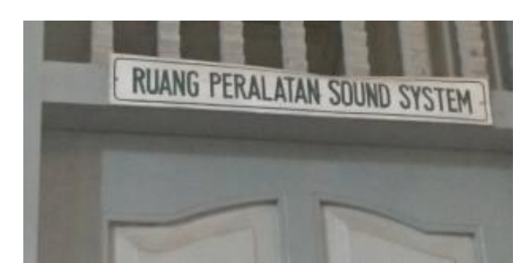
Figure 19. Bilingual sign in Bahasa Indonesia and English (A5/754)

Sign A2/398 writes "Pelajar bukan gangster. Stop bullying." The sign starts with two Indonesian words and then switches to English words. The first sentence means students are not gangsters. The word "gangster" and the expression "Stop bullying" in the second sentence are popular among high school students and more efficient to be used than its Indonesian translation. The red and white background is like the Indonesian flag, possibly emphasising that Indonesian students are not supposed to commit physical abuses as shown in Figure 18. In Datum A5/754, the words 'sound system' have been familiar in everyday use and therefore are combined with the Indonesian words "Ruang peralatan" 'Device storage room" to create such a common phrase for Indonesians. Another recorded example of codeswitching sign is coded A4/625, saying "Save energy", which was later on added with "Matikan yang tidak perlu", a smaller sign in handwriting stuck on it. The additional Indonesian message seems to make the English message clearer, that is to ask the school members to switch off lamps which are not used anymore. So doing, they save energy. The last example of recorded code-switching sign in Bahasa Indonesia and English was sign A3/501, which was sticked on a dust bin. It says "Kebersihan pangkal kesehatan." as the main message, which literally means "Cleanliness is the