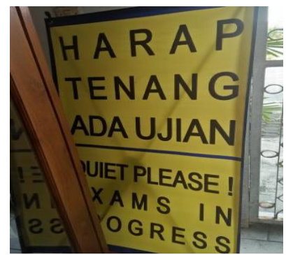
Figure 16. Bilingual sign in Bahasa Indonesia and English (A3/568)

deliver the same message, asking people around the sign to be quiet due to going-on exams. Sign A5/821 is basically an English proverb saying "Easy come easy go", which has the Indonesian translation as Mudah didapat , mudah pula hilangnya . The order of the languages in the two data are different, showing that the language used first is the source language or considered as the main means of conveying the message.