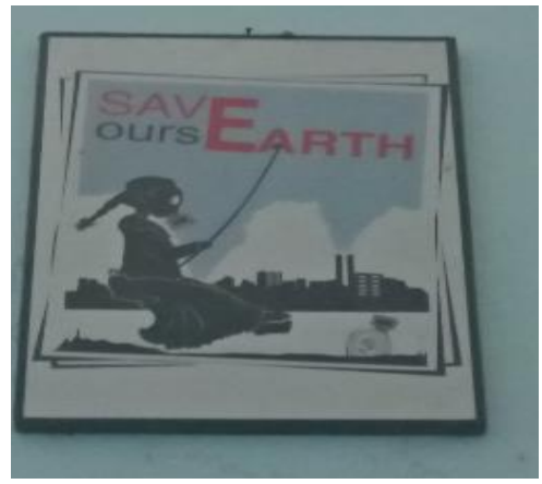
Figure 27. Monolingual sign in English showing a grammatical mistake (A2/338)

The use of English in the school LL was frequently found in three forms: short phrases to name rooms, proverbs, and common expressions such as "No smoking" and "Go green". Schools' efforts to display English in their school areas can be regarded as to show their enthusiasm to promote the language so that school members, especially students, become more and more familiar with it. However, the three forms indicate limited capability of the sign makers to use English creatively. Furthermore, the use of English in longer phrases or sentences in the school signs is not without problems because it shows less capability of the sign makers. As some scholars found, the use of English at LL does not always indicate that the people around the LL are capable of English (Ben-Rafael, et al., 2006; Cenoz & Gorter, 2008; Piller, 2001, 2003). Various mistakes observed from the use of English in the school LL can be seen from following examples.