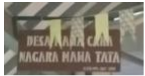
Figure 6. Monolingual sign in Latin-script Javanese (A4/661)

The next language in the monolingual signs is Javanese, the use of which was found mostly in School A4. School A4 promotes Javanese proverbs and culture through this type of signs, as shown in Figures 6 and 7.