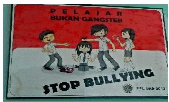
Figure 18. Bilingual sign in Bahasa Indonesia and English (A2/398)