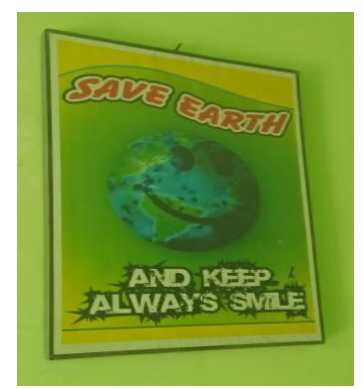
Figure 5. Monolingual sign in English (A2/443)

Sign A2/210 is mostly in green to strengthen its message related to clean and green school environment. The cleanliness inside the building and the plants and trees outside are promoted by School A2.