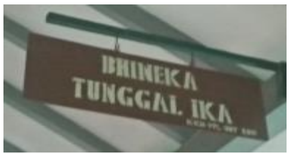
Figure 15. Monolingual sign in Sanskrit (A4/664)