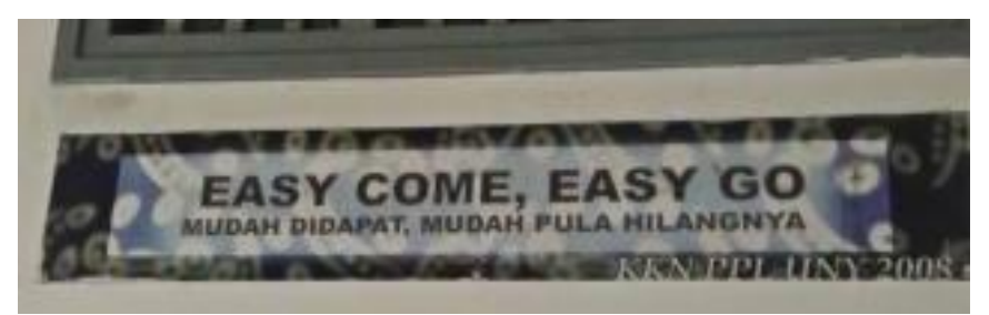
Figure 17. Bilingual sign in English and Bahasa Indonesia (A5/821)