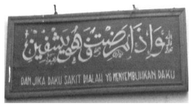
Figure 21. Bilingual sign in Arabic and Bahasa Indonesia (A2/256)

Datum A1/68 says "Innallaha jamiil yuhibbuljamaal" and its Indonesian version, a hadith which means 'Indeed, Allah is beautiful and He loves beauty'. Datum A2/256 "Waidzaa maridltu fahuwa yasyfiin" and its Indonesian version means 'And when I fall sick, He (Allah) is the one who cures me'. This sentence is from the Quran surah Asy-Syu'ara verse 80. The use of Bahasa Indonesia instead of Arabic in these two signs implies that giving the meanings is important for the reader despite the popularity of these original short expressions among Islamic students.