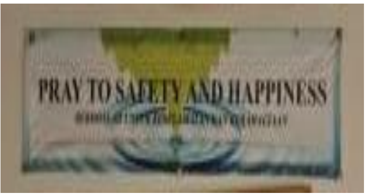
Figure 29. Monolingual sign in English showing a mistake in the use of preposition (A5/835)

Arabic is used in all three sign patterns and most of the signs were found in the two Islamic schools. Although Arabic is not spoken in everyday communications among Islamic school members, several lessons are related to Arabic. Arabic is identical with the language of the Quran and the teaching of Islam cannot be separated from this holy book. The use of Arabic in the school LL is much related to the Quranic verses or the Hadith.