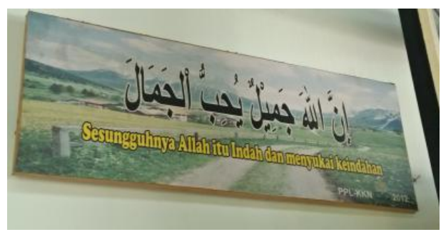
Figure 20. Bilingual sign in Arabic and Bahasa Indonesia (A1/68)

Next are examples of bilingual signs in Arabic and Bahasa Indonesia. All signs in these languages are of the first type. They deliver the messages originally in Arabic, which are translated into Bahasa Indonesia, as illustrated in following Figures 20 and 21.