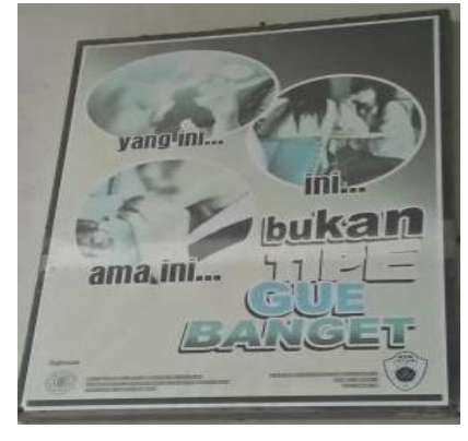
Figure 3. Monolingual sign in informal Bahasa Indonesia on the side wall of a school canteen (A3/459)

The use of English –like that of Bahasa Indonesiawas also found in all five schools, with Schools A2 and A5 being in first and second ranks in frequency. Following are examples of signs in English.