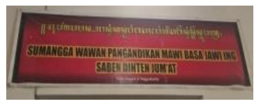
Figure 9. Monolingual sign in both Old Javanese script and Latin-script Javanese (A5/734)

School A1 also uses Javanese to promote batik , as shown in Datum A1/55. Ceprik gringsing is a batik motif closely related to Tulungagung, East Java.