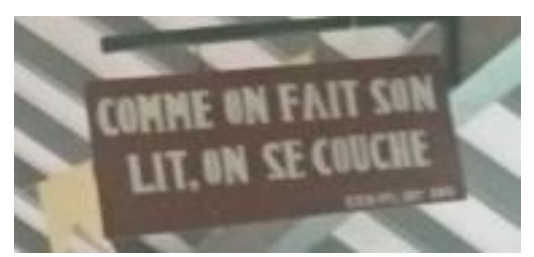
Figure 12. Monolingual sign in French (A4/604)

Other three languages: French, Latin, and Sanskrit which were used in monolingual signs were found only in School A4's four signs, illustrations of which are following.