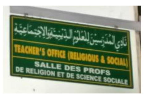
Figure 23. Multilingual sign in Arabic, English, and French (A1/124)

Those two signs in Data A1/96 and A1/124 mark the principal and teachers' offices with Arabic, English, and French. These three languages are foreign languages taught at School A1. Other ten similar signs – five of which also with Bahasa Indonesia- were recorded as Data A1/59, A1/84, A1/127, A1/131, A1/135, A1/150, A1/154, A1/161, A1/165, and A1/177 to mark the school's offices, classrooms, library, and laboratories.