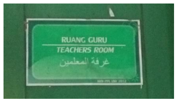
Figure 25. Multilingual sign in Bahasa Indonesia, English, and Arabic (A2/299)