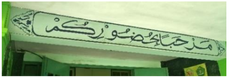
Figure 11. Monolingual sign in Arabic script (A2/193)

School A1's sign in Datum A1/56 is a well-known Arabic greeting "Assalamu'alaikum", meaning 'Peace be upon all of you.' It was posted above a classroom door. The same greeting, recorded as Datum A1/58, was also found above another classroom door.