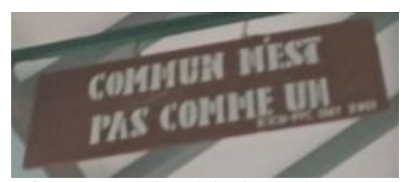
Figure 13. Monolingual sign in French (A4/662)

Comme on fait son lit, on se couche" in sign A4/604 literally means 'As you make your bed, you must lie on it.' This French proverb teaches about the consequence or responsibility someone has due to his deed. Another French proverb in sign A4/662 says "Commun n'est pas comme un", meaning 'similarities hide differences.' This proverb is quite relevant to Indonesia, which has diverse ethnics, languages, and cultures but is united, for example by the same national ideology.