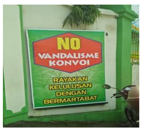
Figure 28. Bilingual sign with English mispelled words (A2/426)

in sign A2/426 show grammatical mistakes and misspelling. Another recorded sign says "Pray to safety and happiness" instead of "Pray for safety and happiness" (Datum A5/835), showing the wrong use of preposition. The English of a famous Indonesian expression Malu bertanya sesat di jalan was found as "Better ask than going ashtray." (Datum A5/803). The word sesat 'get lost' was not written correctly as "astray".