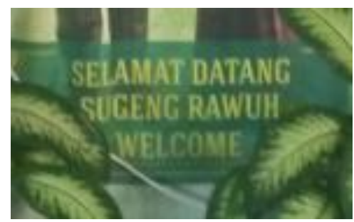
Figure 26. Multilingual sign in Bahasa Indonesia, Javanese, and English (A4/682)