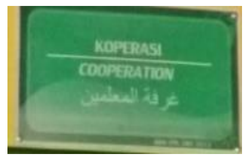
Figure 24. Multilingual sign in Bahasa Indonesia, English, and Arabic (A2/215)

male and female students, wearing batik uniforms or traditional clothes.