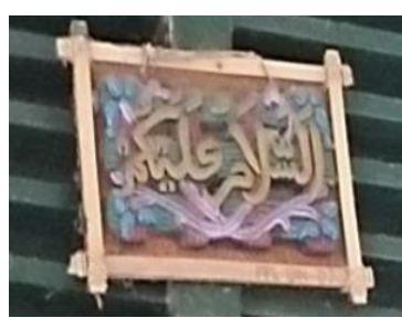
Figure 10. Most common Islamic greeting in a monolingual sign in Arabic script (A1/56)

The fourth language in the monolingual signs is Arabic, which were found in Schools A1, A2, and A4. There were only nine Arabic monolingual signs, eight of which were written in Arabic script and one in Latin script. Following are the examples.