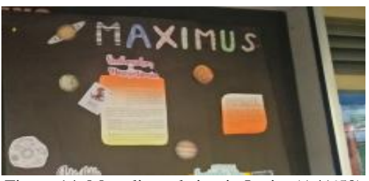
Figure 14. Monolingual sign in Latin (A4/650)

The use of Latin and Sanskrit is shown in Figures 14 and 15 respectively.