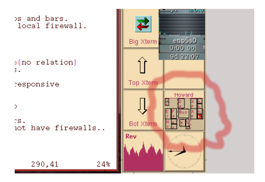
Figure 1: Virtual Windows on FVWM