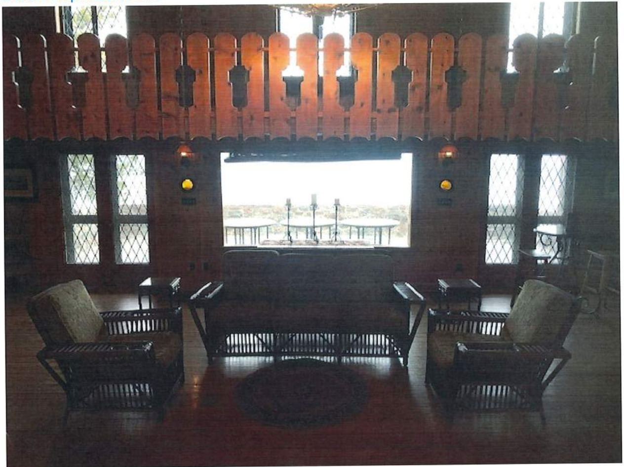
Example of typical Old Lodge Doors and Upstairs Leaded Glass Window Units requiring refurbishment.