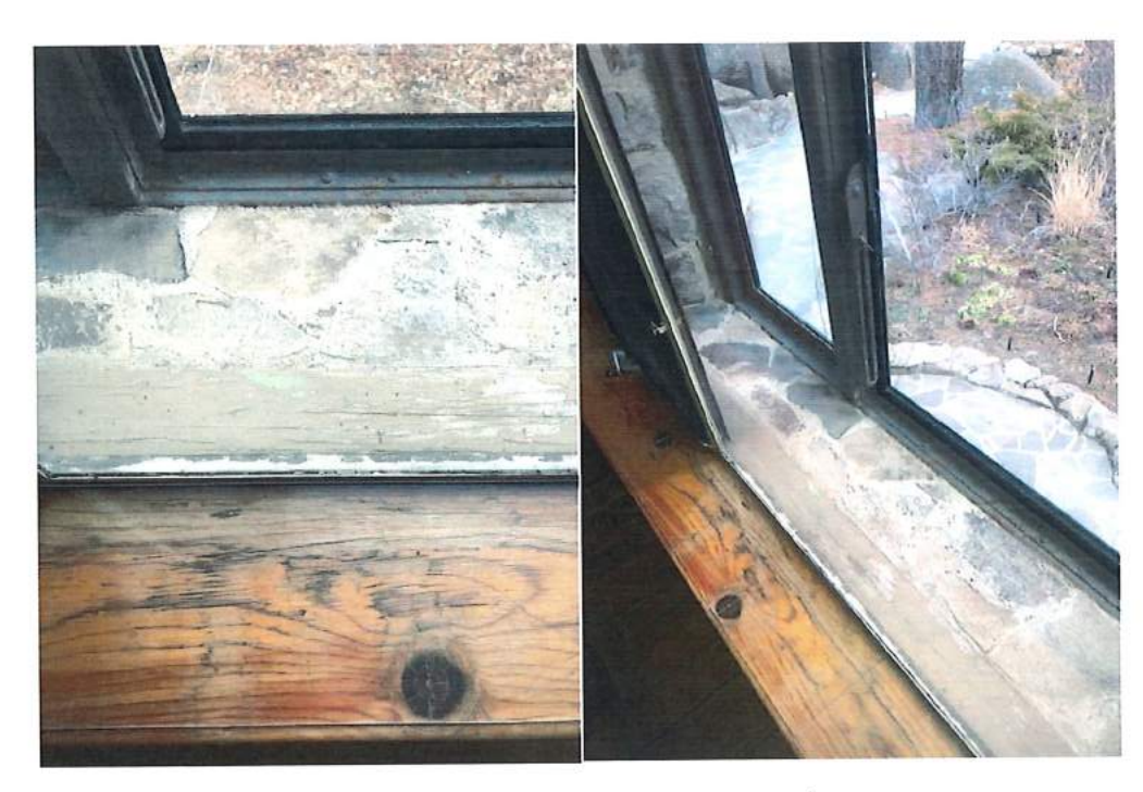
Close-up Detail of Air-Gap Area. Note grout will require replacement.