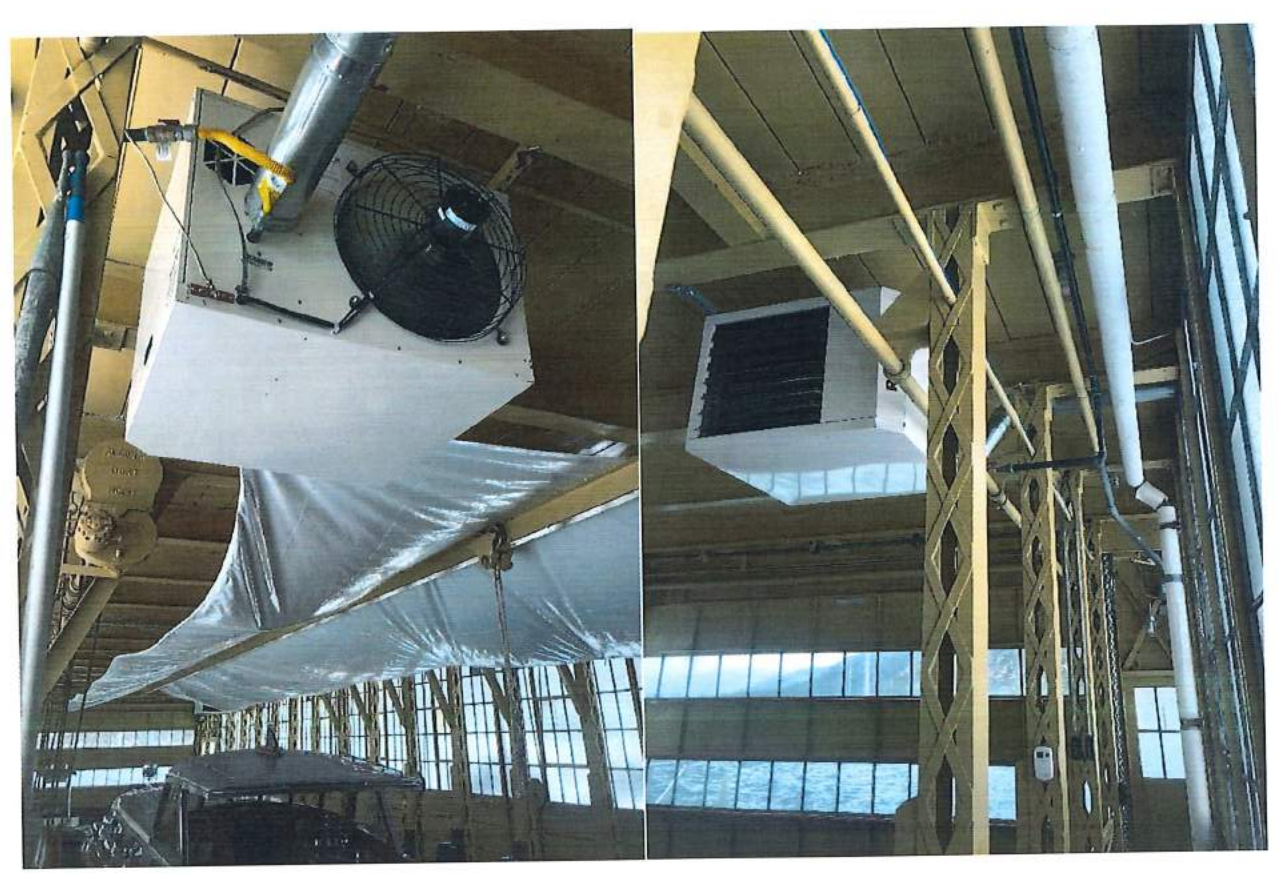
Plimpton Installed Dual State-of-the-Art Reznor Units with new electrical, gas supply, and venting, while Nevada 36 Companies Inc. supplied material and installed hangars, conduit, and control circuits.