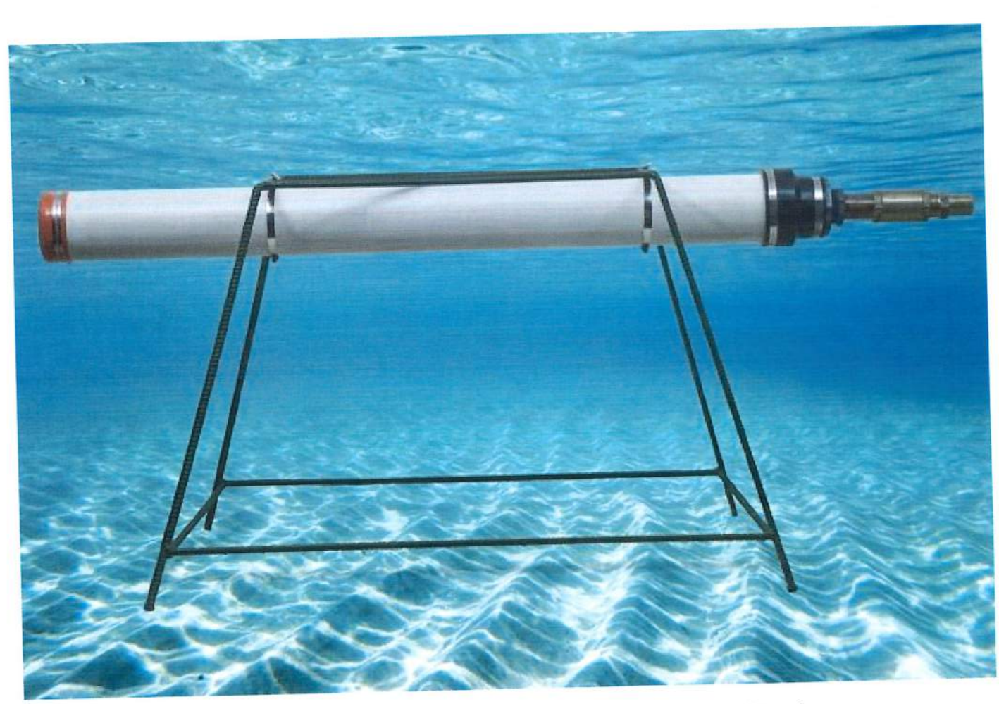
1 of 2 Pristine New Subsurface Pumps Ready for 10-15 Years of Service Fire Codes will Require Addition of 3<sup>rd</sup> Pump next 3-5 Years for Fire Suppression Systems