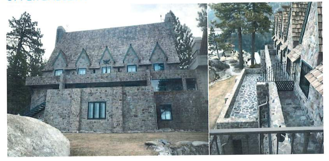
View of Upper Balcony from Lake