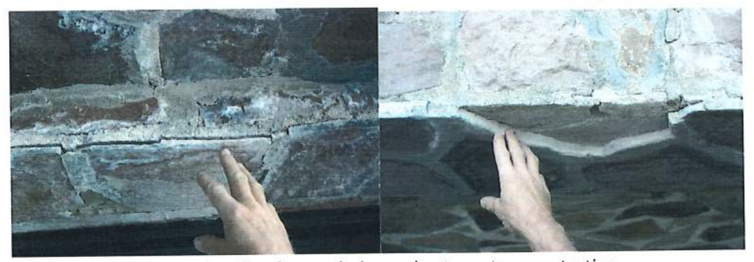
Failing masonry on underside of upper balcony due to water penetration.