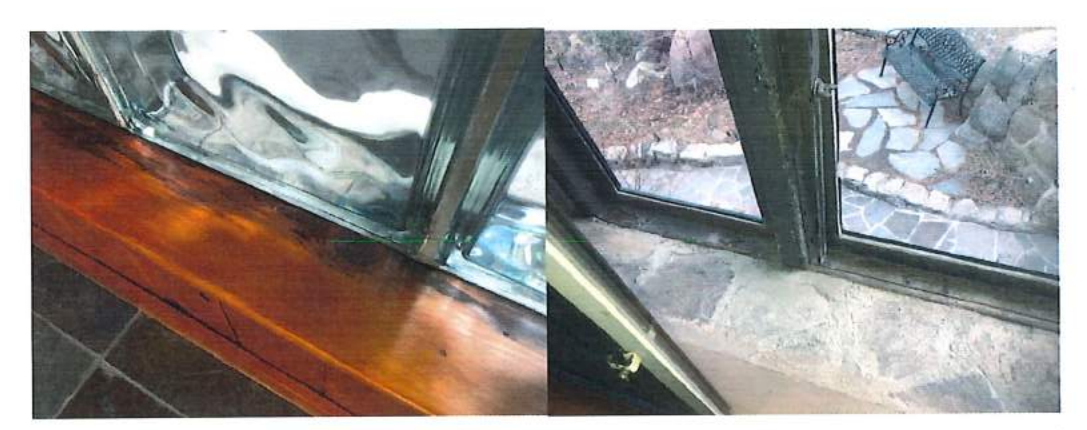
Water seepage under 1930s glass window block onto sills.