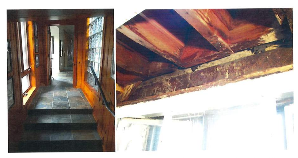
Connector Interior. Glass Block and Ceiling Leaking. Window unit on left has failed.