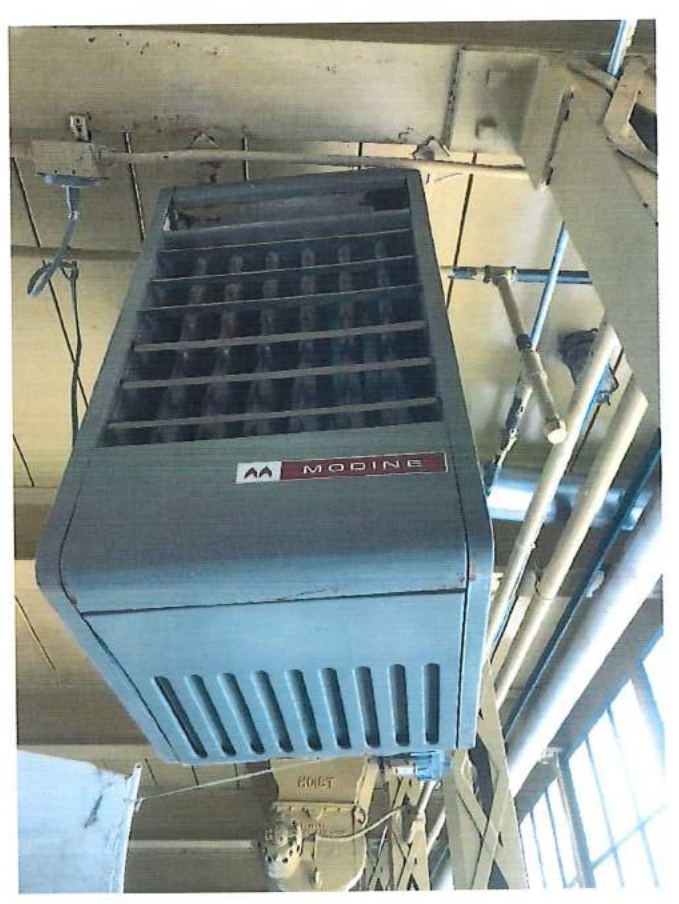
Non-vented, ungrounded, non-compliant 1970s era heater being replaced.

First was installation of freeze protection and replacement control circuits located in the Whittell Estate Boathouse. (All of the pipes supplying the plant with water run through the boathouse. The power, protection and control circuits for the subsurface lake pumps are also located in the boathouse, a vast and complex array of computer-controlled mechanical and electrical systems.) All of these systems need to be protected from freezing and we replaced a vintage, unsafe, and inadequate heater installed in the 1970s with redundant state-of-the-art Reznor heating systems. This required replumbing gas lines throughout the boathouse, installing conduit for electrical circuits, new breaker panels, and generally bringing all systems up-to-code. More than 1000 yards of non-compliant aluminum and undersized electrical wire was removed. Future work will require replacing the 50-year old 800' underground gas line from the water treatment plant to the boathouse.