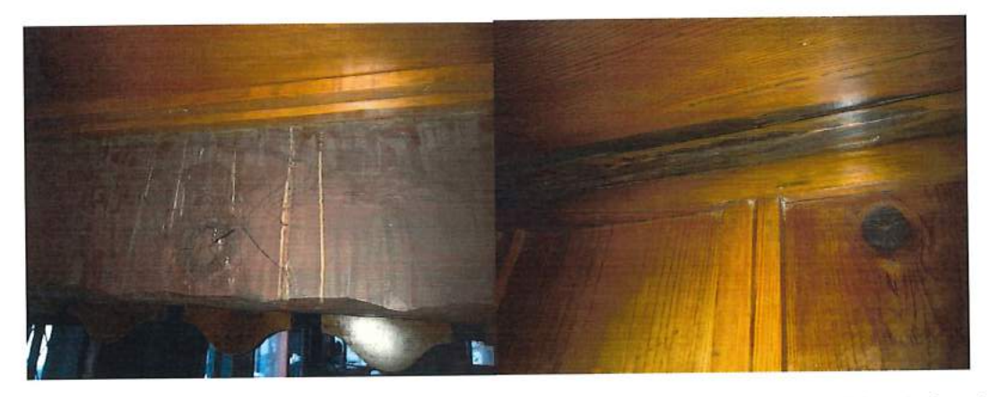
Water Passes Through Balcony Stone to Interior Spaces, below. Mold and Mildew is forming, not to mention what we will find in spaces behind the wall and ceiling boards.