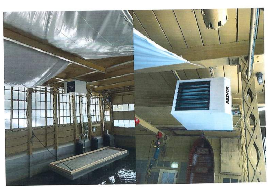
Thunderbird CCCHP Grant 17-06 Progress Report #3