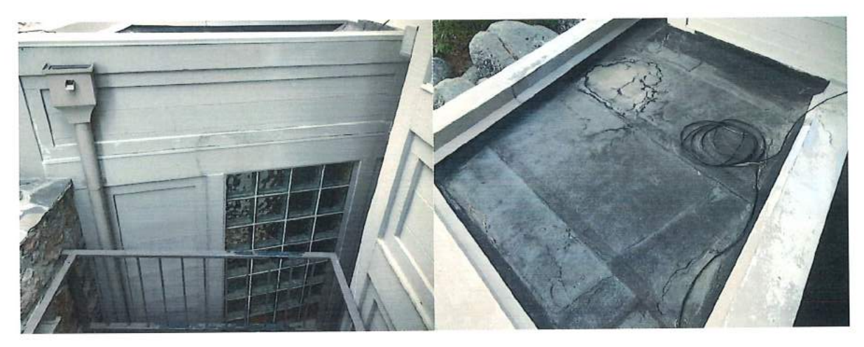
Exterior View of Connector (facing south)

This is the interface between 1930s and 1970s construction, and weather proofing has failed.