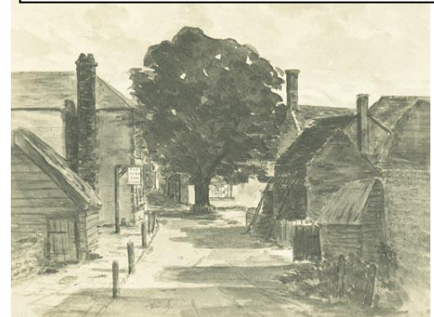
High Street, Littlehampton, c. 1820.