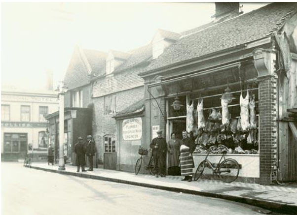
High Street and Surrey Street, Littlehampton, c. 1912.

There has been a settlement at Littlehampton since the early prehistoric era, with evidence to also suggest that a Roman settlement came here shortly after their AD 43 invasion. Littlehampton appears in the Domesday Book of 1086 as the small hamlet of 'Hantone'. The area has continued to thrive over the centuries, with its heydays including being made one of the more important ports along the River Arun, being given town status in 1853, building the railway in 1863 and being known as one of the top holiday destinations in Britain during the Victorian Era. Littlehampton does still continue to thrive today, but its history shows how this has come about.