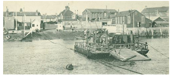
Ferry Crossing, Littlehampton, c. 1905.