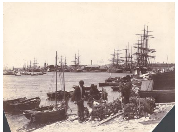
Lobster Fishing in the Harbour, Littlehampton, c. 1900