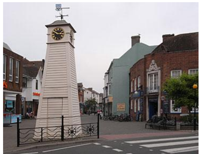
Littlehampton Town Today