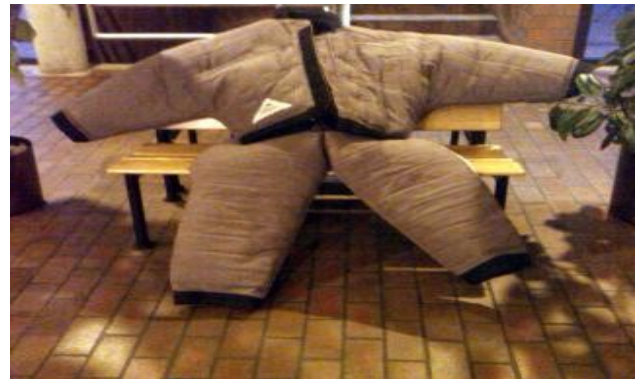
Bite Suit that we purchased for the K9 Unit, May 7, 2009