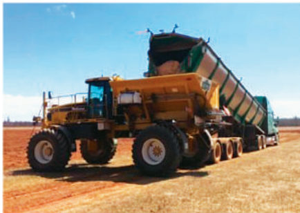
Rear Lift Live Bottom