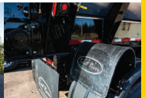
Pneumatic Mud Flaps