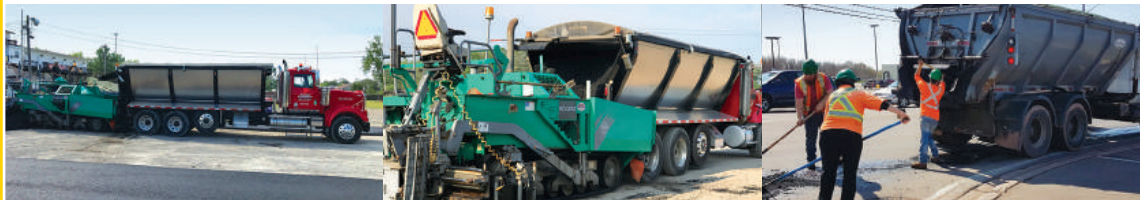
Safer Than A Dump