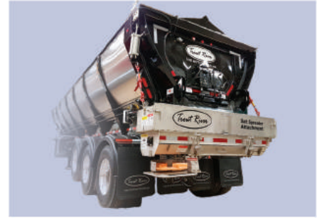
Salt Spreader Attachment