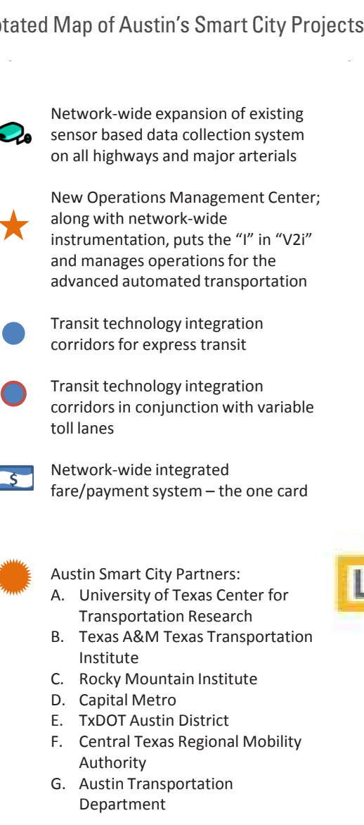
Figure 2: Annotated Map of Austin's Smart City Projects

US 183 Travel Access HUB: located at ABIA; Automated transit shuttle, transportation company coordination & fleet electrification demonstration, acts as a test bed for early adoption US 290 technologies Travel Access Hub: Typical Suburban P&R MOPAC LOOP 360 location (Oak Hill); automated vehicle last mile and vehicle repositioning site, IH-35 carpool and alternative mobility coordination with surrounding employment sites Transit Access Hub: Suburban City outside Capital Metro service area (Pflugerville); carpool electrification, mobility as a service and transit system US 183 extension demonstration site Travel Access Hub: Mueller neighborhood; automated urban district solution demonstration site, connectivity to bike-share, car share and new technologies investments Travel Access Hub: Downtown rail station last mile alternatives demonstration site for emerging technologies US 290