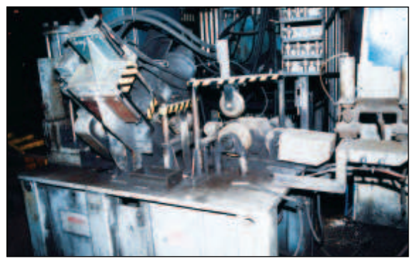
Whitney Angle Master