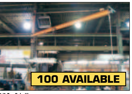
1/2-Ton Pole Jib