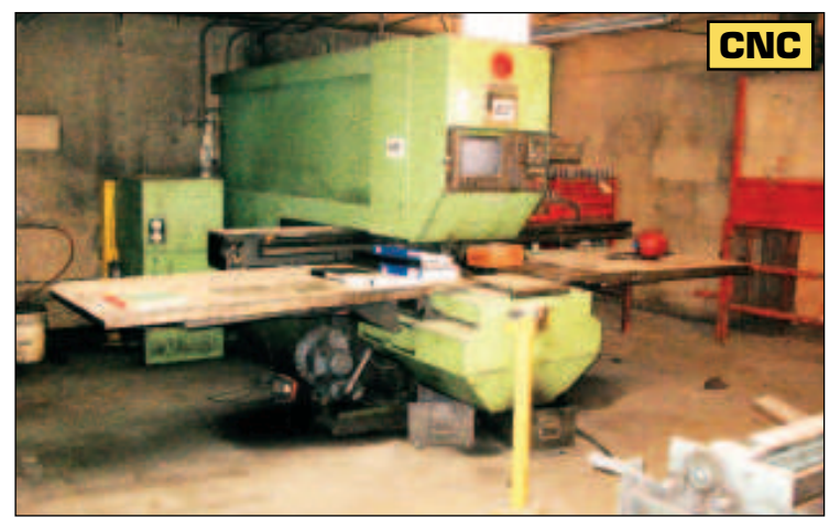
Trumpf Trumatic TC240 Turret Punch