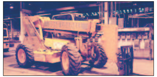
JLG High Reach Load Lifter