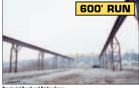
Provincial Overhead Bridge Crane