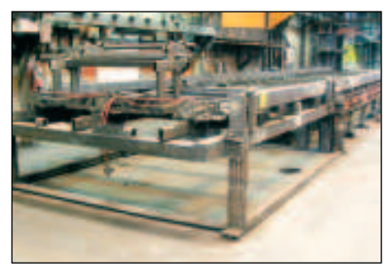
Trailer Transfer Table