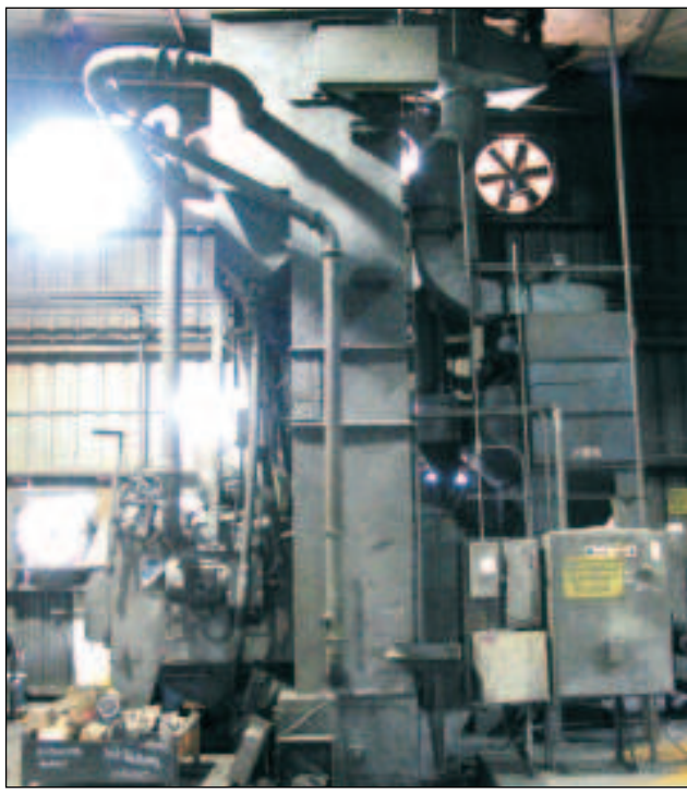
Panghorn Blast Clean System