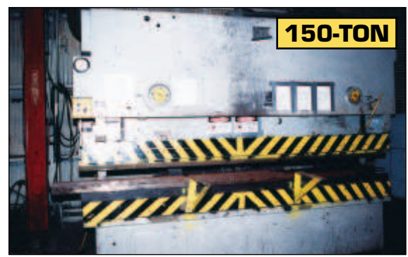
HTC Hydraulic Press Brake