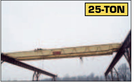
Provincial 90verhead Bridge Crane