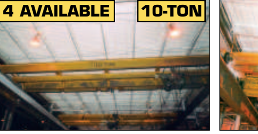
10 & 5-Ton Overhead Bridge Crane