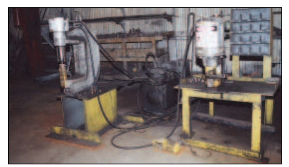
Whitney Webb Flange & Punch