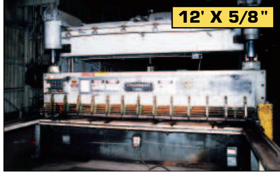
Cincinnati Power Squaring Shear