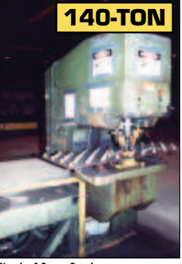
Piranha C-Frame Punch