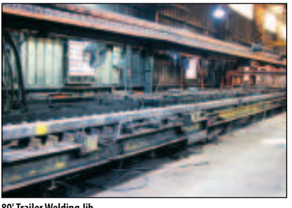
80' Trailer Welding Jib