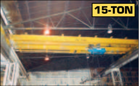
15-Ton Overhead Bridge Crane