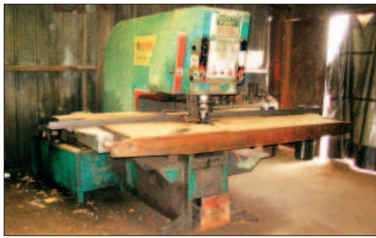
Whitney E3 Turret Punch