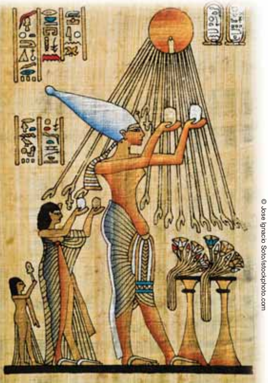
People in some cultures believed that they needed to keep their gods and goddesses happy through offerings and sacrifices.