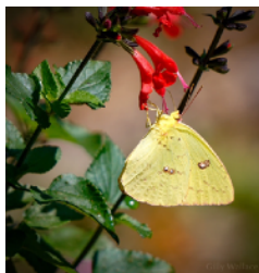
Cloudless Sulphur Butterflies feed on Nectar from Scarlet Salvia well into December

As we move into December's colder weather, there are far fewer butterflies visiting the Butterfly Garden. An occasional Monarch on milkweed flowers, Gulf Fritillaries on tattered patches of passionvines, a few Skippers on asters, and Cloudless Sulphurs enjoying the nectar of scarlet salvias are what remain of the butterflies of summer. Soon, once freezing temperatures arrive, both the flowers and the butterflies will be gone.