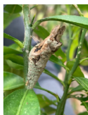
This Giant Swallowtail Chrysalis Overwintered on a Container Citrus Tree and Was Discovered in Late Winter

Less well known are the butterflies that overwinter in a dormant state; these are a large majority of butterfly species. How they spend the winter depends on where they are in their life cycle: either as an egg, a caterpillar, a pupa (chrysalis), or adult. Red Banded and Coral Hairstreaks are examples of butterflies that overwinter as eggs, which are laid in leaf litter on the ground or at the base of their host plant. When the weather warms in the spring, caterpillars emerge from the eggs and begin feeding on nearby host plants. Some butterflies, such as Red Spotted Purples or Eastern Tailed Blues, overwinter as caterpillars buried in leaf litter or soil, in seed pods, or on the leaves of plants. As the weather warms, they begin feeding and growing. As pupae (chrysalises), overwintering butterflies are attached to overhangs or deep in shrubbery (I have found chrysalises attached to an Adirondack chair, my house, under the stairs, and on a citrus tree branch.) Tiger, Black, and Giant Swallowtails and Spring and Summer Azures overwinter in the chrysalis stage and emerge as butterflies in the spring or early summer when nectar flowers are available. A minority of overwintering butterflies are adults, including Question Marks and Commas, Sulphurs, Buckeyes, and Mourning Cloaks. They seek shelter in cracks in rocks or tree bark, in log or brush piles, or in tree or shrub cavities. As adults, they are the earliest butterflies to be seen in late winter or early spring in our area.