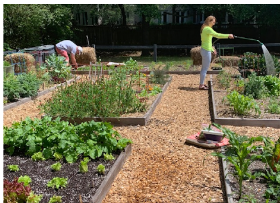
Spring is a Beautiful Time to Work in the Garden

To sign up for a plot in January, send an email to iongarden@gmail.com and request an application form.