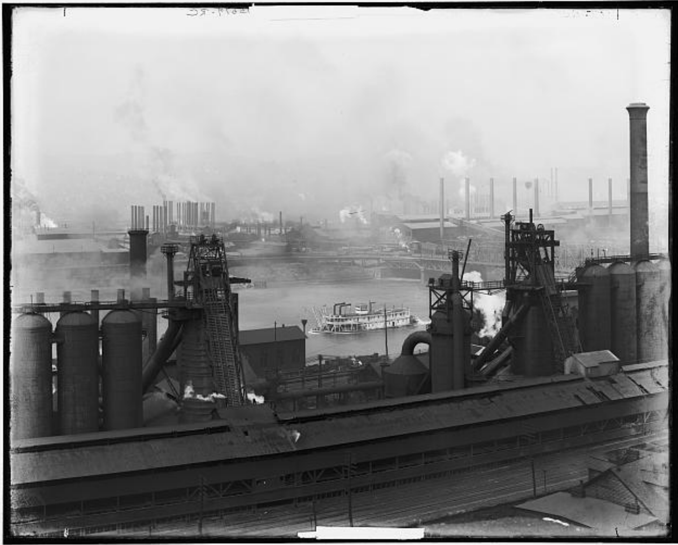
Pittsburgh Riverfront – early 1900s