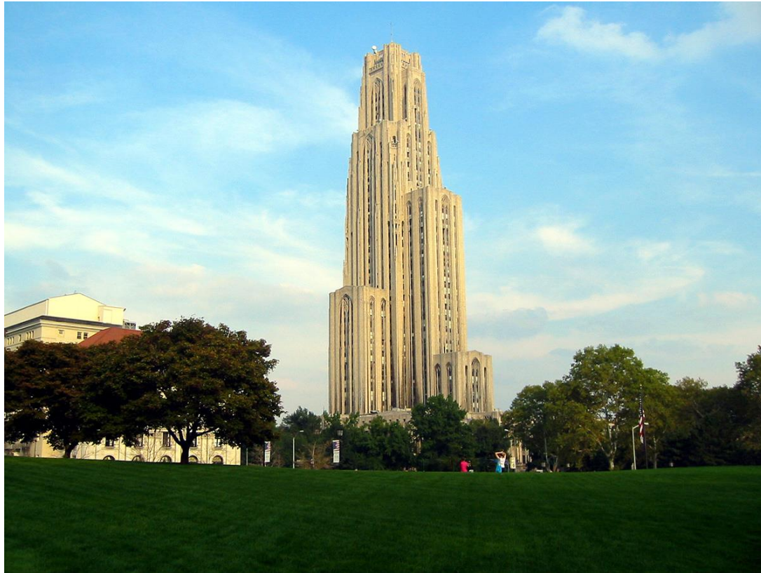
Cathedral of Learning