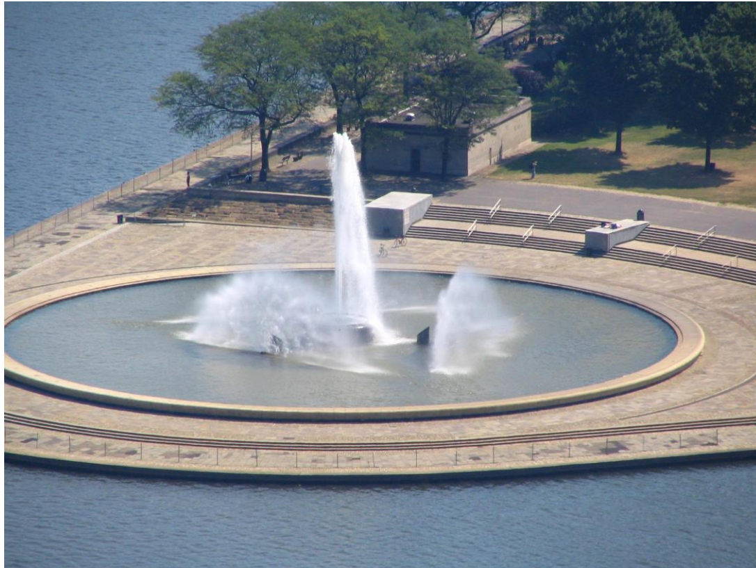
Point State Park