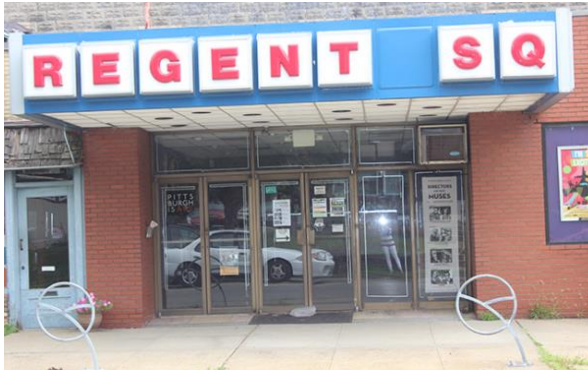
Regent Square Theatre