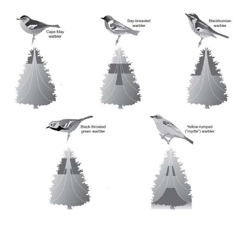
Figure 3. Different species of North American warblers live in different parts of the same trees. The shaded areas indicate the habitats each warbler species occupies.

1. To minimize interspecific competition, organisms often divide the limited available resources in an area, a concept called "resource partitioning." As an example of this concept, the figure below illustrates how different species of warblers utilize different portions of an individual tree.