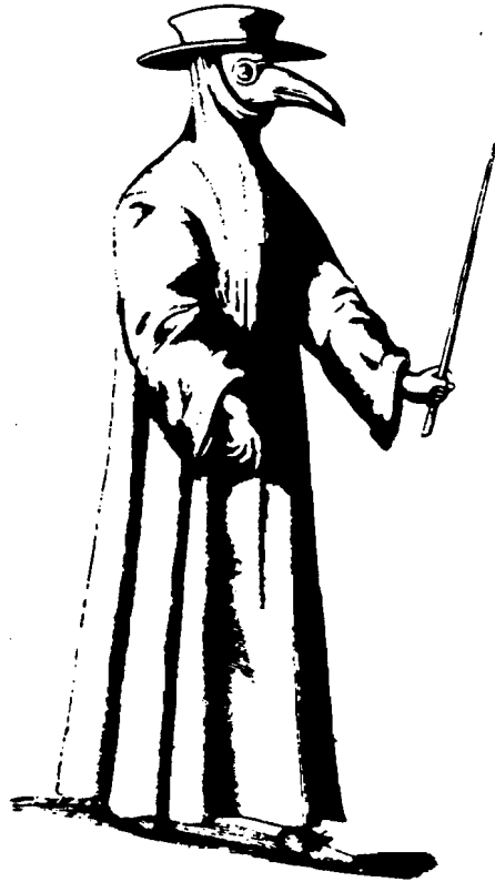
Figure 1. The doctor's robe. The nose of the sinister costume was supposed to act as a filter, being filled with materials imbued with perfumes and alleged disinfectants. The lenses were also supposed to protect the eyes from the miasmas. Illustration from Historiarum anatomicarum medicarum rariorum (1661), by Thomas Bartholin.

and a Habsburg smallpox death led to the War of Spanish Succession. So, when Dr. Zabdiel Boylston introduced inoculation into Boston, Cotton Mather readily took up the idea, for at this time, as we've seen, the ruling class could not afford such "sacrifices for science."