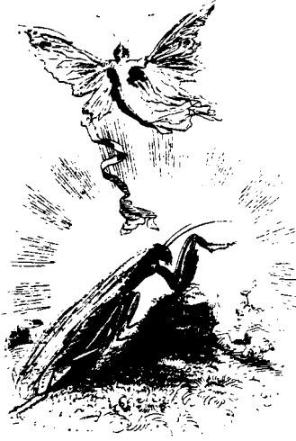
263. The praying mantis tells the insects: "To die is to be reborn into a better life."

Justinian's plague of 543 C.E. as commerce and conquest extended this 'known world.'