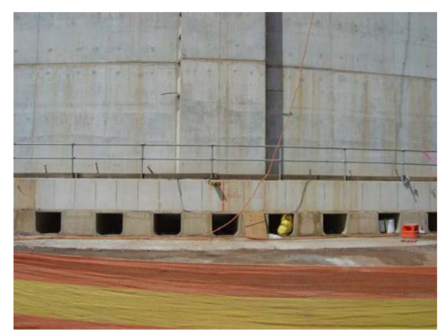
Figure 4 – Bottom anchorage recess for vertical tendons

The 37m long vertical tendons were prefabricated at ground level and then lowered through the top anchorage by crane as a complete tendon. Prefabrication of the tendons and site installation of the vertical tendons is illustrated in Figure 5.