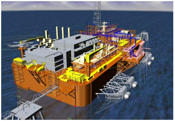
Figure 11 – Adriatic LNG Terminal

Another 150,000m<sup>3</sup> LNG tank is currently under construction in Cartagena (Spain) with an outside diameter of 81m and an inner height of 40m. The containment walls are 800 mm thick, posttensioned vertically and horizontally. As with the 5<sup>th</sup> and 6<sup>th</sup> Barcelona tanks, the work is being undertaken with the BBR CONA post-tensioning system by the Spanish BBR Network Member, BBR PTE. The construction is expected to be completed by the end of 2006.