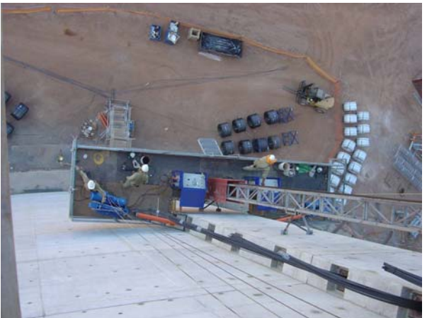
Figure 8 – Strand pusher operating on the access platform

The horizontal tendons were installed one strand at a time using specially designed high capacity strand pushers. The strand pushers are electronically controlled and can be set to automatically stop at any desired distance. Figures 7 and 8 illustrate the strand pusher equipment and pushing operation.