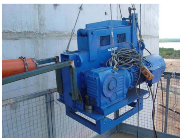
Figure 7 – High capacity strand pusher