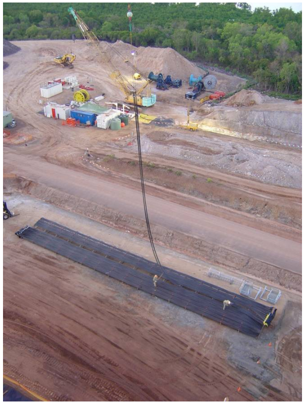
Figure 5 – Installation of prefabricated vertical tendons

Access to the horizontal tendons was via mast climbing work platforms measuring 10m long. The work platforms could be shaped to suit the geometry of the workface and allow access to any level. A typical mast climbing platform is shown in Figure 6.