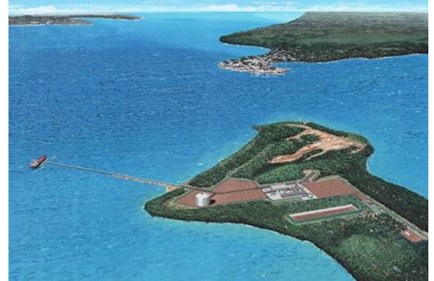
Figure 2 – Darwin LNG tank

The LNG processing plant at Darwin receives gas via an undersea pipeline from the Bayu-Undan gas field in the Timor Sea, some 500km north west of Darwin (refer to Figure 2 for an artist impression of the plant). The liquid is then pumped to the storage tank at a temperature of -162^{\circ} C prior to shipment to customers in Japan.