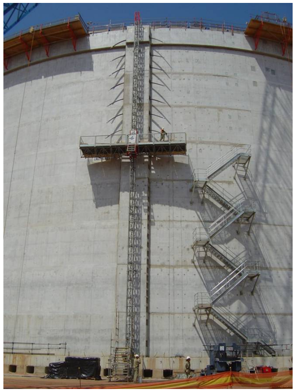
Figure 6 – Access platform at pilaster