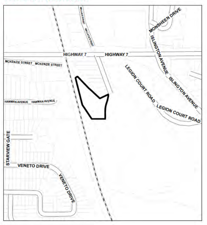
Map 13.56.A South End of Wallace Street