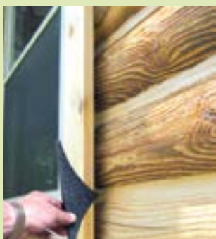
Use Log Gap Cap™ where round logs meet window and door jamb trim