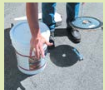
Replace the lid. Make sure that it is tight on the pail