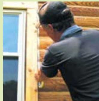
Apply masking tape to prevent sealant from smearing onto the adjacent logs