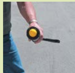
Attach the end cap and cone tip to the end of the barrel