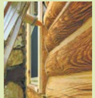
Fill the 3/8" gap between the surface of the foam and the edge of the frame with sealant