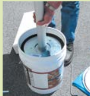
Remove the cap and cone tip from the gun barrel and push the end of the barrel onto the hole