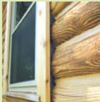
Insert Log Gap Cap™ into void between logs and frame. Leave 3/8" gap between surface of foam and edge of frame