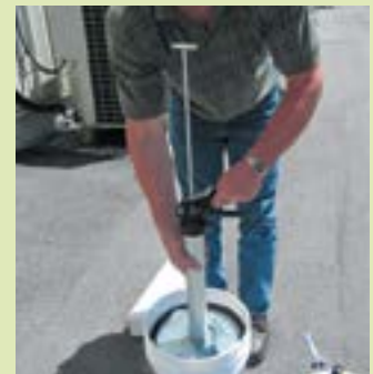
Ensure the tight seal, fully extend rod and fill the barrel. Disengage from the follow plate