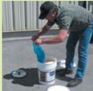
Remove the lid and the plastic liner from the pail