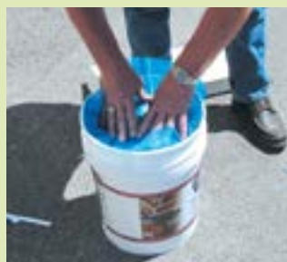
Replace plastic liner over the surface of the sealant