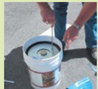
Insert the handle rod into the open nut to remove the follow plate