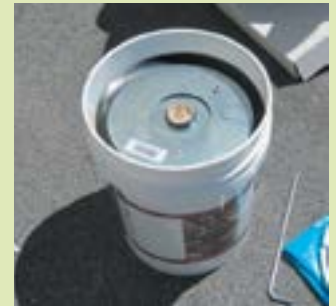
Place the follow plate on top of the chinking pail